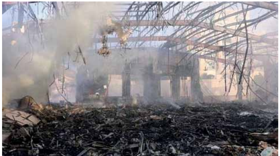
Yemen Post Newspaper

Since then, the Saudis have admitted that "the on the ground intelligence was inaccurate." The Saudis regularly kill people indiscriminately in market-places, in funeral processions, and in wedding parties—in fact, in