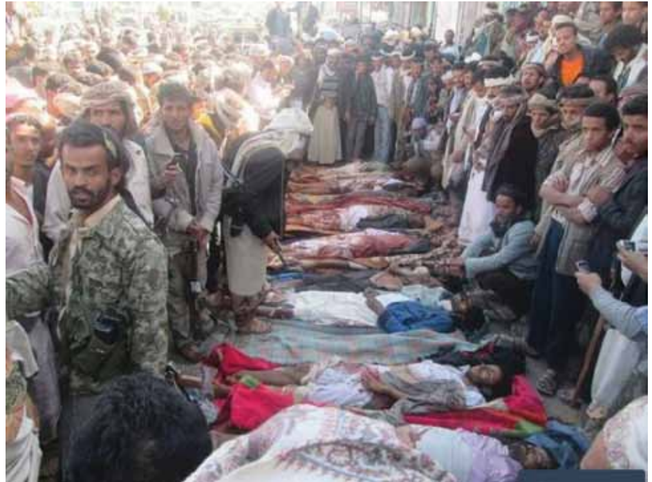
U.S. drone killed 17 innocent civilians in Ra'ada, Yemen in 2013.

The fact of that lawless killing being done under the pretext of “defense of the homeland,” despite its being unacknowledged, has also had a great destructive effect on the psychology of U.S. domestic law enforcement, many of whom are former military personnel. Take for example the problem of the shootings and violence, as well as police violence, in American cities. To what degree has the resonance of eight years of drone killings, mass executions, murderous deposi-