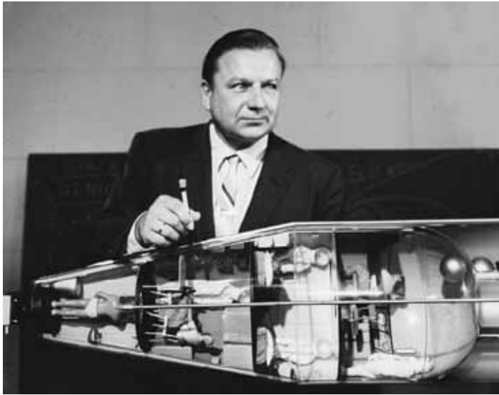
Krafft Ehrlicke demonstrates the plan for the interior of a space station.