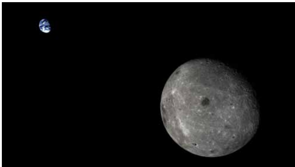
State Administration for Science, Technology and Industry for National Defence, China

Lunar industry should be viewed as an organism that, over time, evolves to progressively more