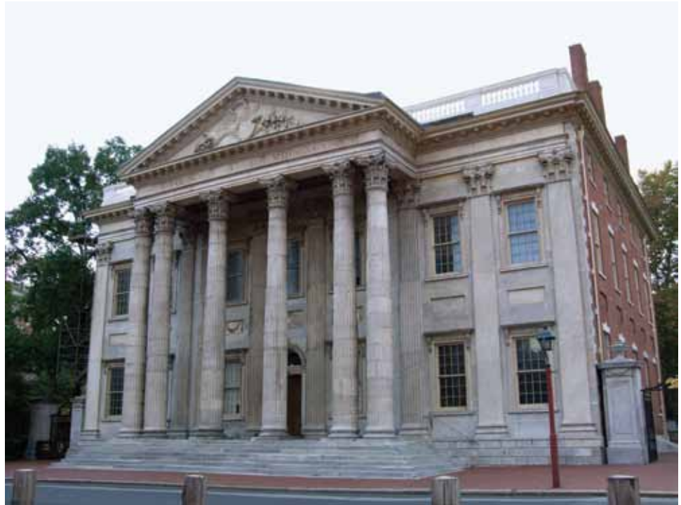
First Bank of the United States (1797-1811), 120 South Third Street, Philadelphia, Pennsylvania.

No arbitrary actions are allowed. No tyrannical actions. Every action, beginning with the assumption of Revolutionary War and State debts, through to the pro-