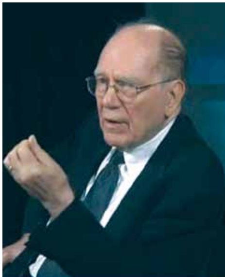
Lyndon H. LaRouche, Jr.

You have to get an international agreement among nations, among a significant number of