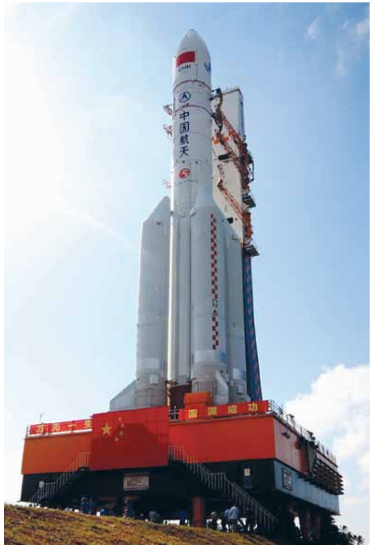
China National Space Administration

Since the 1970s, China has used a family of Long March rockets that has seen incremental improvements in payload capacity and other factors over the