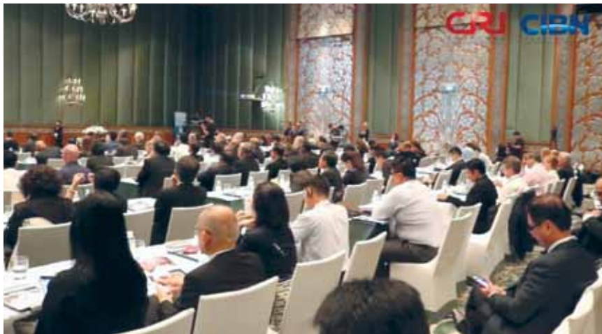
Participants at the Sept. 11 conference on the "Thai Canal: Comprehensive Study of Alternative Logistics Systems for the Maritime Silk Road."

caying United States economy. This is the reason for the ongoing coup attempt against him. The more rapidly he and the American people fully adopt and efficiently make known their support for the LaRouche Great Projects approach, the sooner we can end the dark era of perpetual warfare, and realize a new paradigm of peace and development.