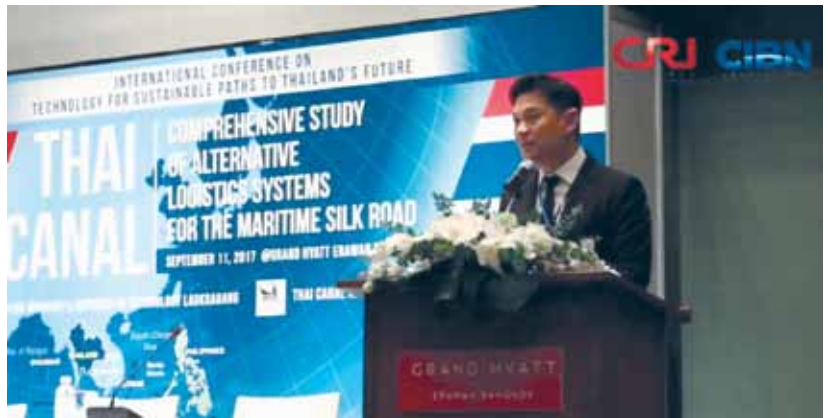
thai canal news

Unlike in the 1980s, the new King of Thailand, Maha Vajiralongkorn, is said to support the Kra Canal project, and several leaders of the Privy Council, including its current President (and a former Prime Minister) Prem Tinsulanonda, are strong supporters. The new King will