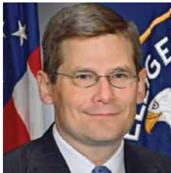
CIA Michael Morell