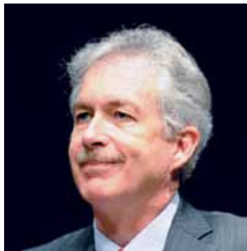
U.S. State Department William Burns