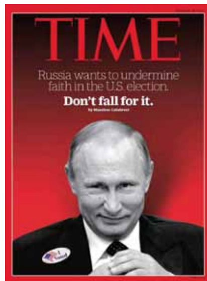
Examples of the media effort to villify Russian President Putin as an evil schemer.

monic influence. Somehow Putin has found a magic formula to infect the American mind and spread the infection. The Russians, it is claimed, were able to use a minuscule social media effort (when compared to the 2016 presidential campaigns and PACs) to somehow make race, police violence, or similar issues, brand-new and hugely divisive concerns in the United States.