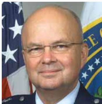
Michael V. Hayden