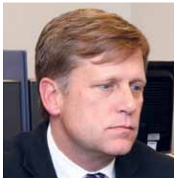
Michael McFaul