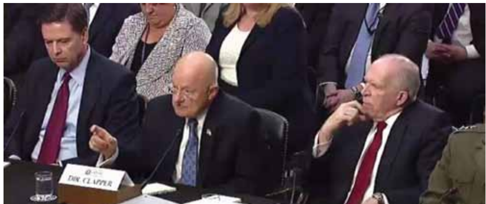
Director of National Intelligence James Clapper (center), FBI Director James Comey (left), and CIA Director John Brennan (right) at the Senate Select Committee on Intelligence, Feb. 9, 2017.

A good start to exposing the deeper foundations of the coup attempt against Trump, then, consists of continuing to “peel the onion” on the Steele dossier and its use by Obama's FBI, Justice Department, and intelligence chiefs. Congress is being stonewalled by Robert Mueller and Deputy Attorney General Rod Rosenstein on its questions concerning the Steele dossier, and this stonewall is presently the subject of a contempt of Congress claim being prepared by the House Intelligence Committee, against Attorney General Sessions and Rod Rosenstein. The President should consider ordering the Justice Department to declassify the materials sought by Congress, explaining to the American people why doing so is a matter of national security. A second investigative track should involve a security review of those occupying the various Eurasian and Russian desks in the State Department, Justice Department, and the rest of the intelligence community—during the Obama years and presently—starting with those actively involved in the Ukraine coup. What has their role been in the illegal leak campaign against Donald Trump?