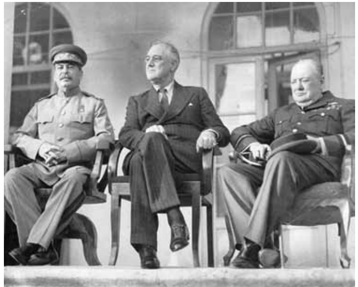
Stalin, Roosevelt and Churchill at the Tehran Conference, 1943

Through the course of the war, FDR, as well as Generals MacArthur and Eisenhower, realized that general war was no longer a means to settle political disputes among nations. The horror of modern warfare was too great, even before the arrival of nuclear weapons. Roosevelt envisioned a United Nations Organization (which was the name of the war-time alliance) as a place to debate and find solutions to conflict among sovereign nations freed from colonialism. FDR had a clear idea of the development needed to truly liberate colonies. His vast geographical knowledge was essentially a map of needed development projects, such as he envisioned when he flew over North Africa and proposed to an uninterested Saudi king Ibn Saud. The great Four Corners projects that he had led in the U.S. were the paradigm for what Roosevelt envisioned globally.