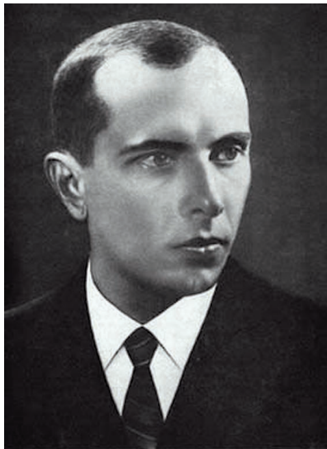
The fascist Stepan Bandera, who fought with the Nazis against the Soviets. He was heroized by Euromaidan coup leaders.