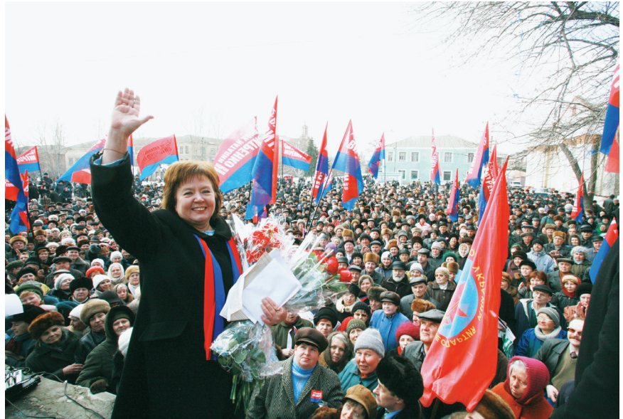
Natalia Vitrenko at a rally of her party, the Progressive Socialist Party of Ukraine.

citing SBU “suspicions” about Vitrenko’s receiving money from the Russian Foreign Ministry-run Fund for the Support and Defense of the Rights of Compatriots Residing Abroad. The allegations date to May 2014, when the bank accounts of Gift of Life were frozen. According to Ukrainian media, this was done “in the framework of an SBU investigation of funds transfers through Ukrinbank, intended for persons suspected of infringement of the territorial integrity and inviolability of Ukraine.” A flood of media reports named Vitrenko as a major sponsor of separatists and terrorists, which are broad categories used by the current Ukrainian authorities against their political opponents.