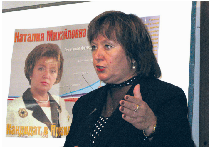
Natalia Vitrenko, doctor of economics, is chairman of the Progressive Socialist Party of Ukraine, has served in Parliament, and has run for President.

Meanwhile, in Ukraine, Dr. Natalia Vitrenko, the