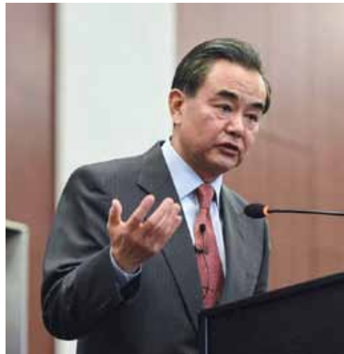
Chinese Foreign Minister Wang Yi speaking at the Center for Strategic and International Studies (CSIS) in Washington, D.C. on Feb. 25, 2016.

Donald Trump—who surely isn't perfect and must still demonstrate whether the trust placed in him was