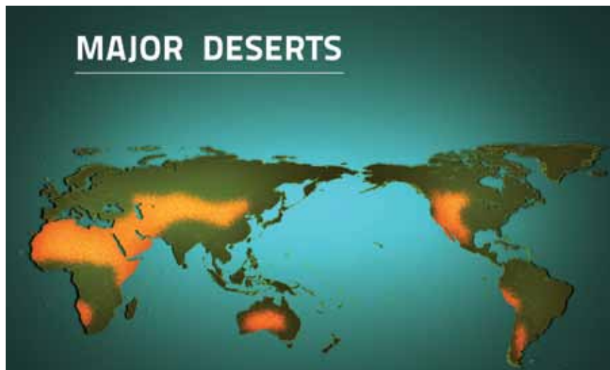
The vast desert that stretches almost continuously from the Atlantic coast of North Africa through the Arabian Peninsula, all the way through to western China, represents a major challenge for economic development for all the nations involved.