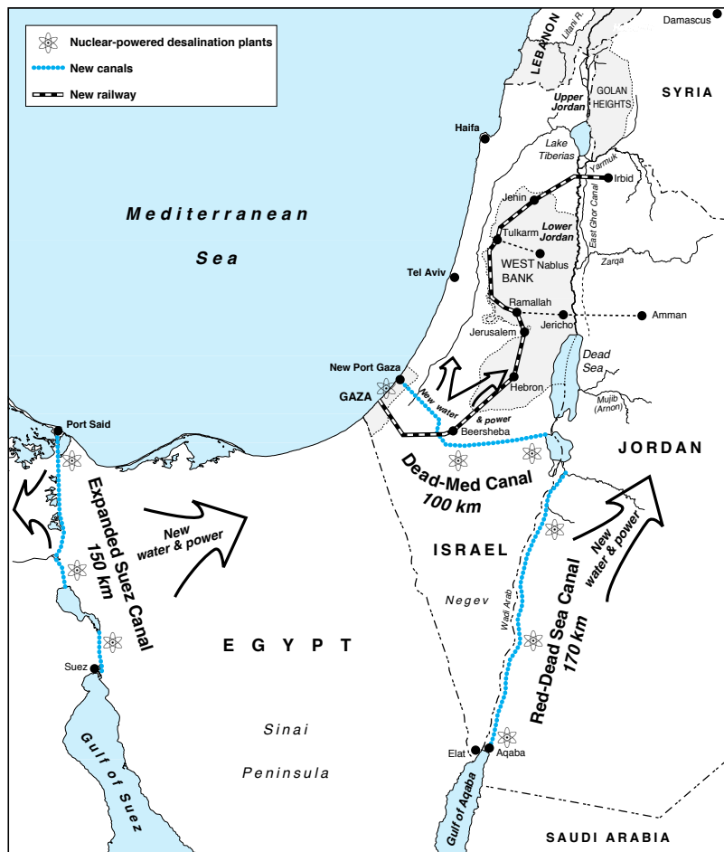
FIGURE 6 Features of the Oasis Plan, 1980

The roots of this plan for solving the water crisis in the Middle East go back to the mid-1970s, but it was codified in 1990, when LaRouche was campaigning to stop the first Gulf War.