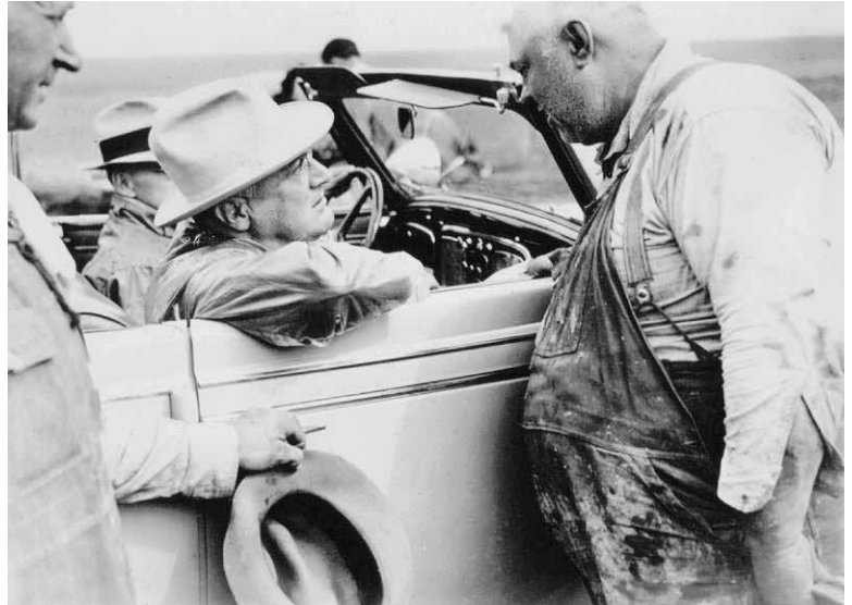
President Franklin Delano Roosevelt talking with a homesteader in North Dakota in 1936.

In his April 7, 1932 address, FDR charges that while the previous Hoover Administration had created a $2 billion fund to bail out the big banks and corporations, that fund did not address the forgotten home-owner and the farm-owner who were being dispossessed in large numbers through foreclosures of their mortgages. Hoover’s bailout aided the big banks which were en-