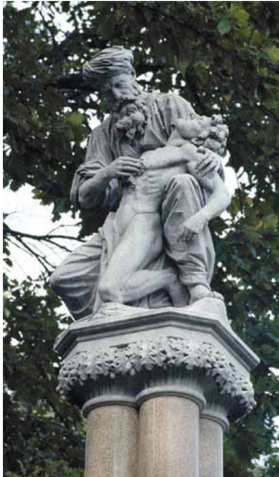
The Good Samaritan , by John Quincy Adams Ward, 1867, in Boston Public Gardens.

This article hopefully will fill in the picture.