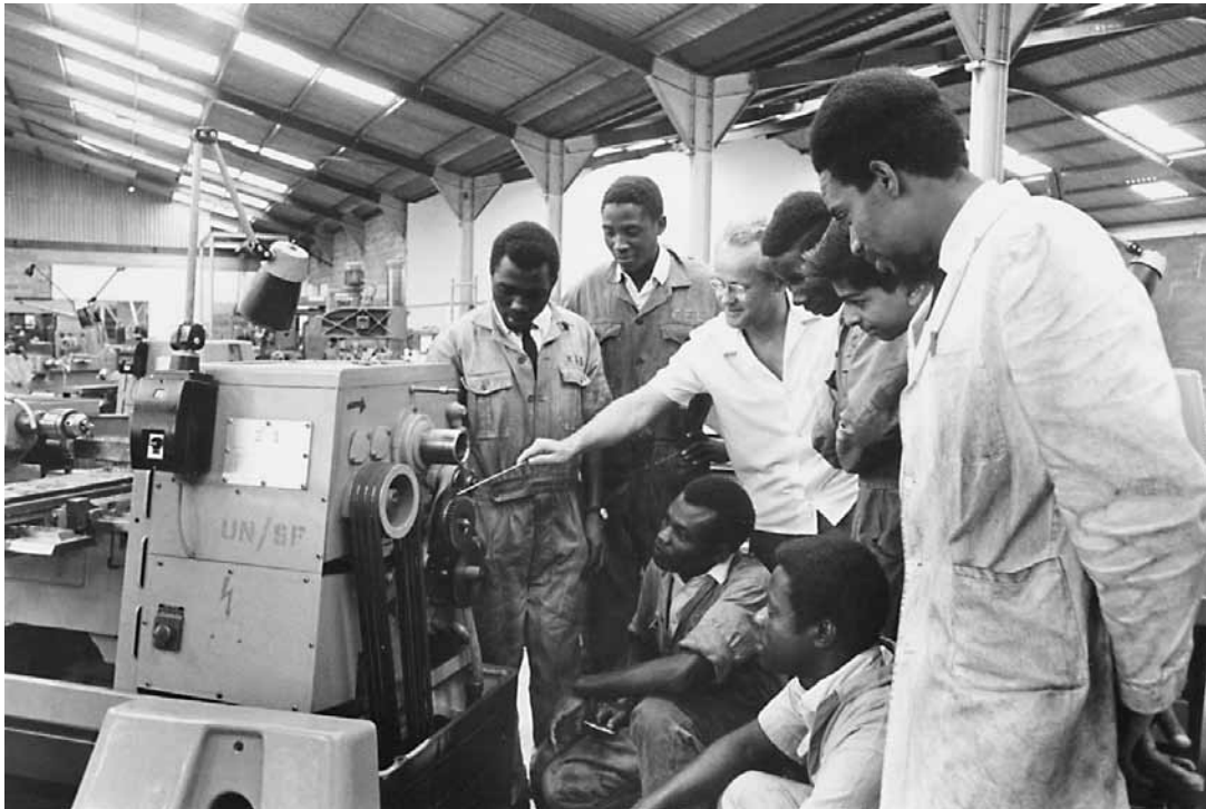
The basis for the dialogue of cultures needed today, is to be found in the conception that each person is made in the likeness of the Creator. Here, a Polish metal trades instructor trains Kenyans in Nairobi.

which all nations and peoples might premise a suitable fraternity.