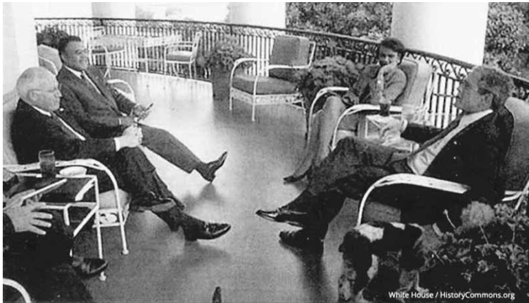
Saudi Prince Bandar at the White House. From left, Dick Cheney, Prince Bandar, Condoleezza Rice, and President George W. Bush, Sept. 13, 2001.

port network for the San Diego hijackers. There were multiple documents in the San Diego FBI files referencing well-known sympathies for Al-Qaeda by employees of the Saudi embassy in D.C., including Osama Bin Laden's half-brother. There were records of checks paid to Saudis supporting the two San Diego hijackers from Bandar's wife. There was also a CIA memorandum carefully tracking Saudi government support for Al-Qaeda and other Saudi terrorist organizations.