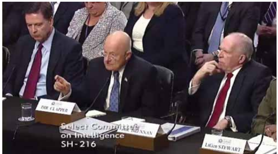
Senate Intelligence Committee

The Democrats, the news media, and their Republican allies led by John McCain and Lindsay Graham, went berserk over the factless Obama Administration