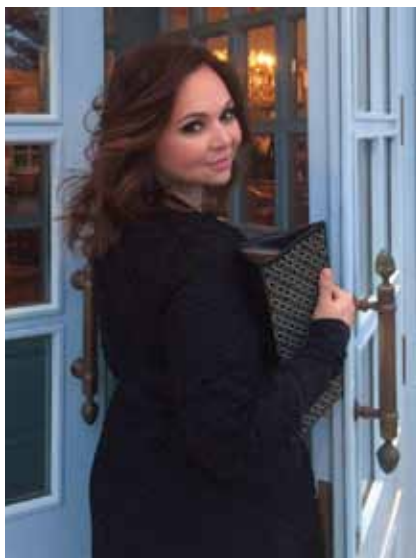
Natalia Veselnitskaya