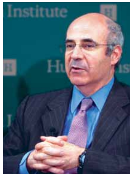
British intelligence operative William Browder.