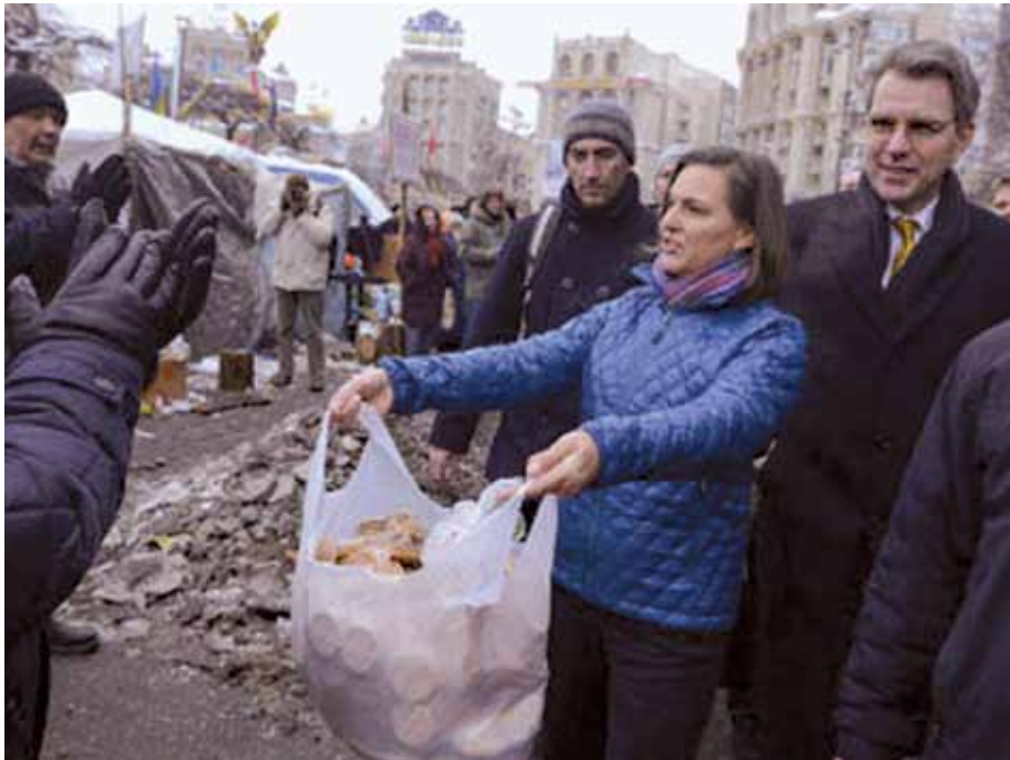
Victoria Nuland, of President Obama's State Department, hands out cookies to ground troops of the color revolution in Kiev, 2014.

in which nation states collaborate for development based on the common aims of mankind.