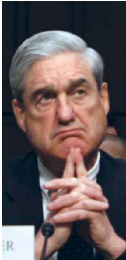
Robert Swan Mueller III

In recent weeks, organizers for the LaRouche movement have been repeatedly told by citizens they meet: