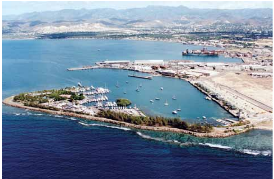
U.S. Army Corps of Engineers

In southeast Texas, there are key locations along the Gulf Coast for which sea surge barriers are appropriate, and proposals exist, along with flood-water control sys-