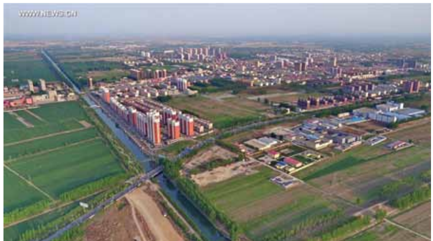
To move non-capital functions out of Beijing, the government of China announced plans April 1 for construction of Xiongan New Area, a new metropolis that will span Xiongxian, Rongcheng (above) and Anxin counties in Hebei Province southwest of Beijing.

Here again the “Belt and Road Initiative” is the