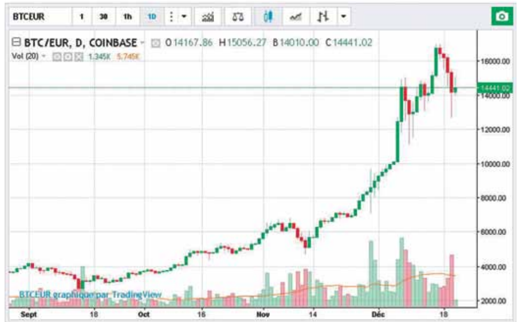
Dramatic speculative increase of the bitcoin price.

We live today, in many ways, in George Orwell’s dystopia (or is it Bertrand Russell’s utopia?), where we manage to make believe that black is white, or that injustice is just. In the same way we have been made to believe that bitcoins (and other cryptocurrencies) are an alternative to “the system,” although they are nothing but one of its most extreme and perverse expressions. It is entirely consistent with the libertarian project inspired by one of the designers of modern ultra-liberalism, Friedrich von Hayek, promoter of “private” currencies independent of any state. Herald-ing cryptocurrencies as an alternative, is to pass control to a system in which currencies have been effec-