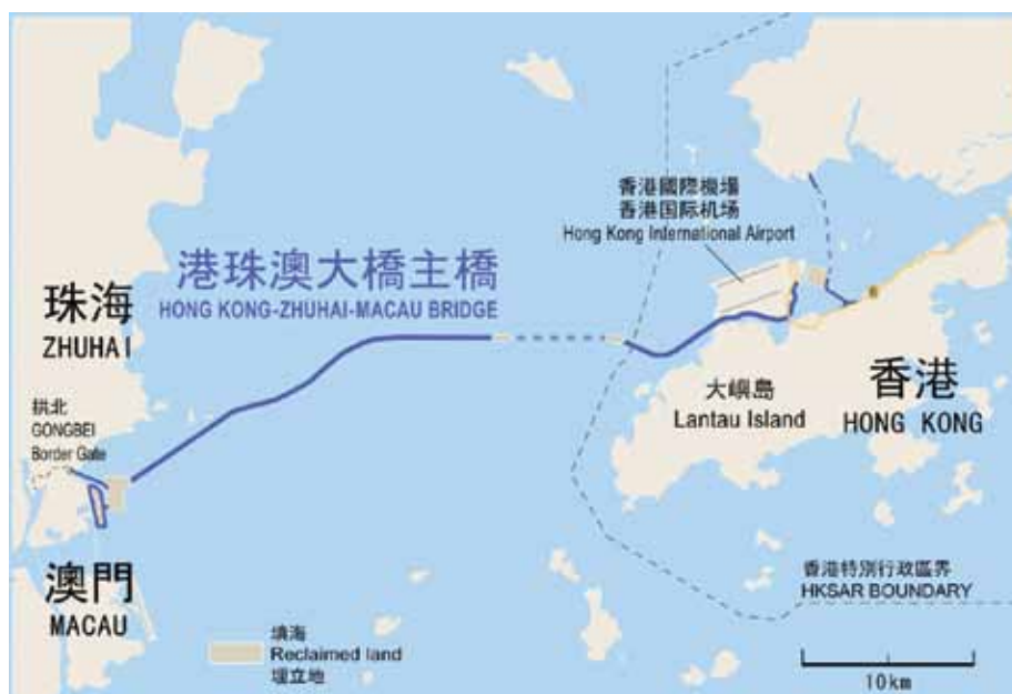
Diagram showing the bridge-tunnel complex which connects the former British- and Portuguese-owned cities, Hong Kong and Macao, to China.

(this was later revised to 22% from the governments and 78% in loans from a consortium of banks, headed by Bank of China).