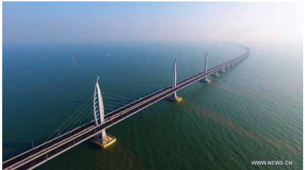
Aerial photo of the Hong Kong-Zhuhai-Macao Bridge on Dec. 27, 2017.

"Prior to the 1970s, where was the global center of