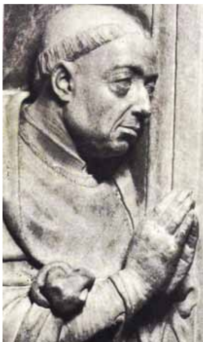
Nicholas of Cusa 1401-1464

You will not find another faith, but rather one and the same single religion presupposed everywhere. You, who are now present here, are called wise men by the sharers of your language, or at the very least philosophers or lovers of wisdom.