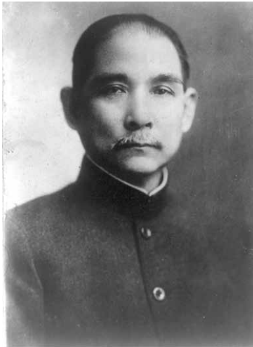
Sun Yat Sen

Wang decided to test Zhu Xi's hypothesis that every created thing possessed an essence, a principle. He and a friend therefore sat down in his father's garden in front of some bamboo, and determined to sit there and study this bamboo until they discovered the principle of bamboo. They sat there for many hours until they finally got sick and had to give up. His conclusion: There's no such thing as principle; it doesn't exist. It's only what's in your mind; that's the only thing that's real to Wang Yang Ming. Cultural relativism, basically.