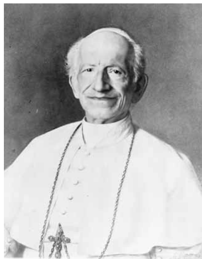
Pope Leo XIII

Confucianism is generally known as the philosophy of Ren (sometimes spelled Jen ). Here is what Confucius said when a student asked, what is ren ? "Love all men," he answered. It's not just love. It's sometimes translated in English as "love." It's sometimes translated as "benevolence," but I would argue that the only accurate translation would be " agapē ," which is the Greek word that has become commonly used in English as a higher form of love—a love of mankind as a whole, a love of God, a love of the Creation. In this passage, from the Analects of Confucius, the student then asks, "What about wisdom?" The Master said, "Know all men." It doesn't mean to know this or that fact, or to know every person in the universe, obvi-