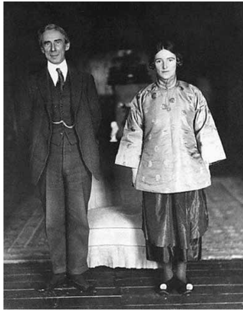
Bertrand Russell, left, and his companion Dora Black on his arrival in Shanghai, China, in October 1920.

This is a classic example of the “noble peasant” or “happy peasant” idea of British imperialism: Go into a country, profile it, find the most backward tendencies