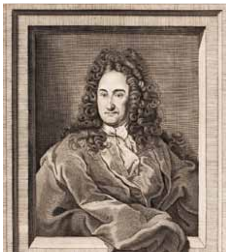
Gottfried Wilhelm Leibniz