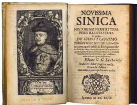
Frontispiece of Novissima Sinica, 1697.

This is a beautiful expression of what Helga Zepp-LaRouche calls “The Spirit of the New Silk Road.” This is the concept that great civilizations, in coming in contact with each other, joining forces, acting on the basis of the common interests of these two cultures, can lift up the less developed portions of the world. This is precisely the concept that inspired Lyndon and Helga LaRouche when they first proposed the idea of the New Silk Road, following the collapse of the Soviet Union in the early 1990s.