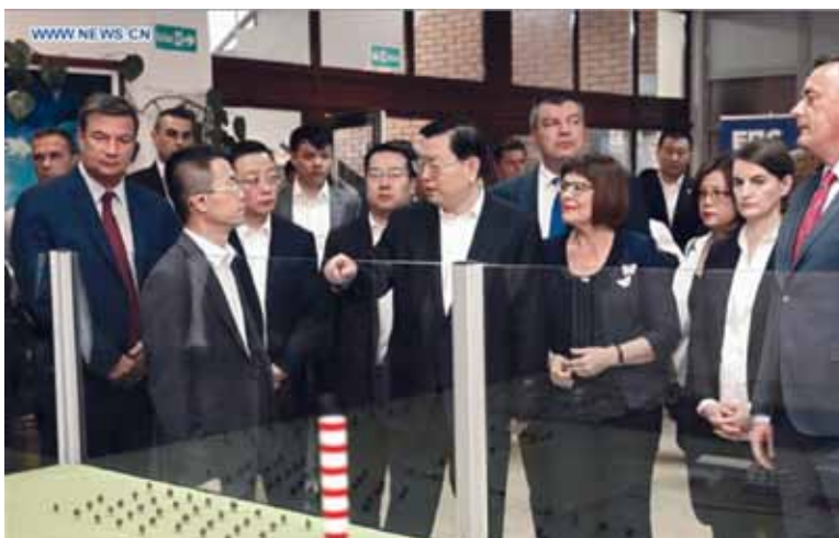
Zhang Dejiang, chairman of the Standing Committee of China's National People's Congress (NPC), visits a power station during his visit to Serbia, July 17, 2017.

It is quite certain that were the Serbian economy to be included in the global value