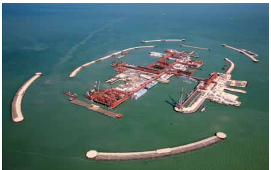
Kashagan off-shore oil field.

But there's the question of how to deliver the crude to consumers. Of course, the idea of using pipelines is very attractive. However, if the Eurasian Canal is com-