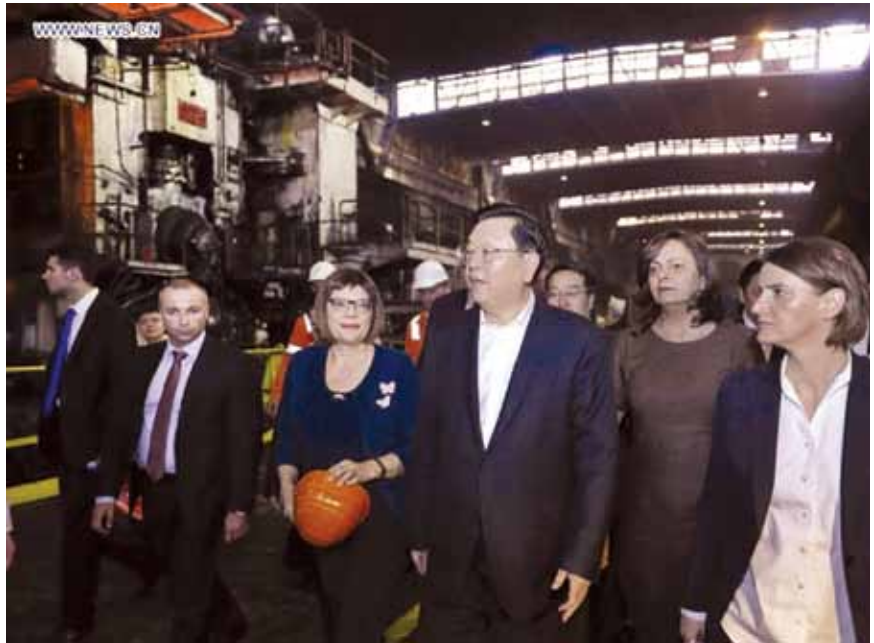
Zhang Dejiang, chairman of the Standing Committee of China's National People's Congress (NPC), visits a steel mill during his official visit to Serbia, July 17, 2017.

Hence, economic cooperation with China represents a huge opportunity for development, and also provides good evidence of successful conduct of foreign policy, which promotes co-operation on the global level and contributes to the constructive meeting of East and West. However, if Serbia wants to increase its influence and importance in international relations based on economic co-operation with China, its business with China must be based not only on past success and achievements, but also on improving its real economic capacity, through the various types of investments. In industry infrastructure, in this sense, Serbia will have to successfully involve itself in international production through the global value chains which derive not only from proprietary invest-