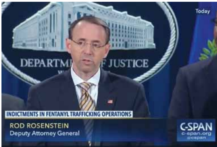
Deputy Attorney General Rosenstein and FBI Director Wray were forced into an agreement with House Speaker Paul Ryan.