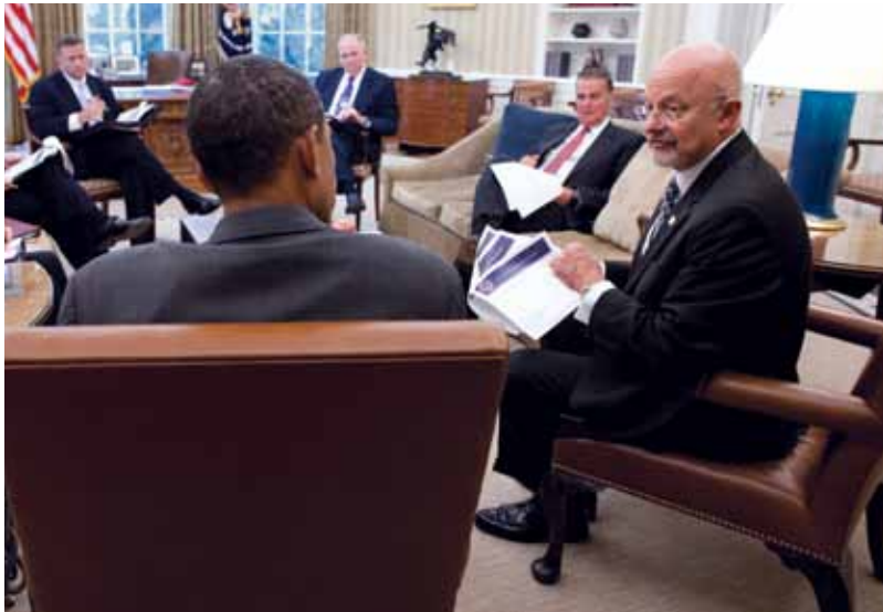
Office of Director of National Intelligence

Director of National Intelligence James Clapper (right) talks with President Barack Obama in the Oval Office, with John Brennan and other national security aides present.