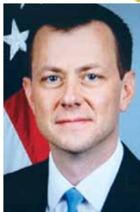
FBI official Peter Strzok.

Press coverage pumping up Christopher Steele’s dodgy dossier.