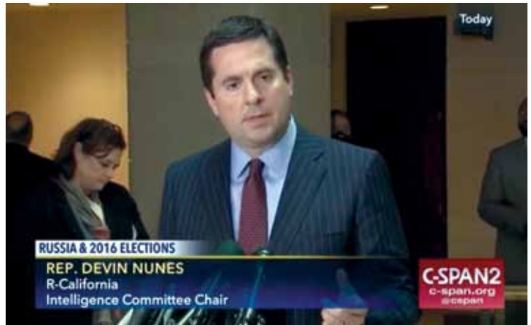
House Select Committee on Intelligence Chairman Devin Nunes.