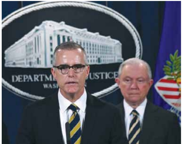
Deputy Director of the Federal Bureau of Investigation, Andrew McCabe, left, and Attorney General Jeff Sessions at the Justice Department, on July 13, 2017.

Wray had insisted, prior to viewing the Nunes memo and prior to a briefing on the Inspector General’s preliminary findings, that he would not fire McCabe, but, instead, allow him to retire in March. It was the Horowitz investigation which unearthed the now infamous texts between former Clinton and Trump FBI case-agent Peter Strzok and his FBI mistress, Lisa Page. Those texts referred to an FBI “insurance policy” against Trump assuming the Presidency, an insur-