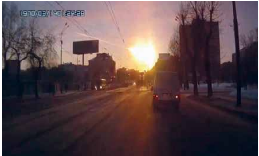
Explosion of the asteroid over Chelyabinsk, Russia, February 15, 2013.

The urgency of the SDE is underscored by recent events. In the last 110 years, we have experienced the incredible damage of the impact of such un-seeable small space rocks. The 1908 Tunguska Event, is the most modern destructive evidence of such impact. What was most probably an asteroid traveling at about 15 km per second exploded over Siberia with a power estimated to be hundreds of times that of the bomb dropped on Hiroshima. That blast destroyed about 800 square miles of forest, flattened about 80 million trees, and left hundreds of burnt reindeer carcasses. On Feb. 15, 2013 a relatively small asteroid exploded over Chelyabinsk, Russia with a blast equivalent to more than 300,000 tons of TNT, shattering windows for miles, injuring more than 1,000 people, and damaging 3,000 buildings. This