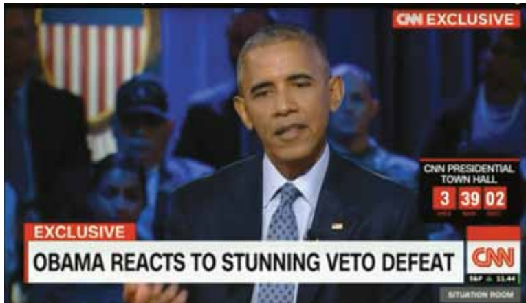
The Justice Against Sponsors of Terrorism Act was passed in 2016 over Obama's veto.

Once the families overcame Bush Administration attempts to kill the very idea of an investigative commission, the person originally designated by George Bush to head the Commission was none other than Henry Kissinger. When the families succeeded in disqualifying Kissinger, based on obvious conflicts of interest, Philip Zelikow was inserted, instead, as staff director, controlling the entire investigation.