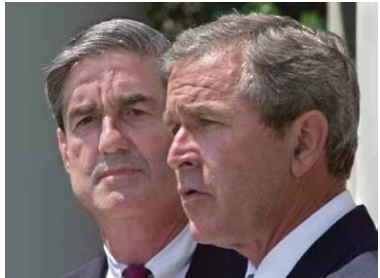
President George W. Bush announces Robert Mueller to be director of the FBI, during an event in the Rose Garden, Thursday, July 5, 2001.

Were the President to declassify all of this information, Mueller—who played an absolutely critical role in this cover-up—would stand exposed, having nakedly obstructed justice with regard to the actual events of 9/11. Mueller covered for the Saudis and the Bush Administration while playing an essential role, as FBI Director, in creating the modern U.S. surveillance state, which now engulfs all of us. Creation of the modern Leviathan in which we now live was the result intended by the perpetrators of 9/11. By this single act of declassification, the President would be free of Robert Muel-