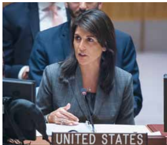
Nikki Haley, U.S. Ambassador to the United Nations.