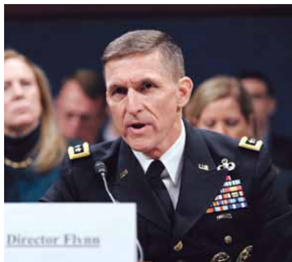
U.S. Army Lt. Gen. Michael Flynn, former director of the Defense Intelligence Agency.

We have come to a point, probably more dangerous than any time in my lifetime—and I'm counting the time, when as kids we used to have air raid drills, and we'd get under our school desks, and our teachers would tell us to cover our eyes, so we wouldn't be blinded by the blast, and cover the back of our necks, so something wouldn't hit us and break our necks. People understood nuclear war then, because we had dropped the atomic bombs on Japan, and they understood what it could do. Today, it's sort of vague, it's very distant.