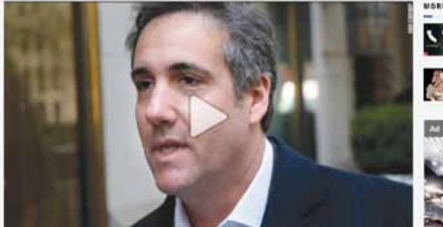
Michael Cohen, President Trump's attorney.