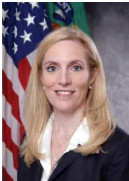
Department of Treasury

His comments added to concerns ECB regulators already had about liquidity problems with clearing houses, which first emerged following the Brexit vote, over fear that clearing houses based in London would no longer be under Brussels' jurisdiction, making euro-denominated derivatives trades by EU traders outside the euro-zone even more risky. The London-based euro-clearing house trade can top a notional figure of $900 billion per day, and considerations from the ECB about reducing or eliminating the use of "non-EU" clearing houses posed a real threat to clearing house operators.