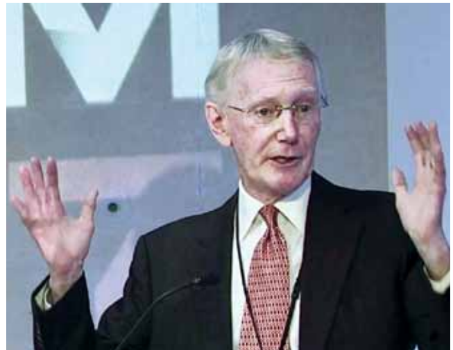
Institute for New Economic Thinking

There is an intense economic/diplomatic revolution underway, with new financial institutions, such as the Asian Infrastructure Investment Bank and the BRICS bank, along with large Chinese state and private banks, providing massive amounts of credit for projects. Nations which previously had no option but to subject themselves to looting by London-centered banks, being denied credit, and forced to adopt murderous austerity