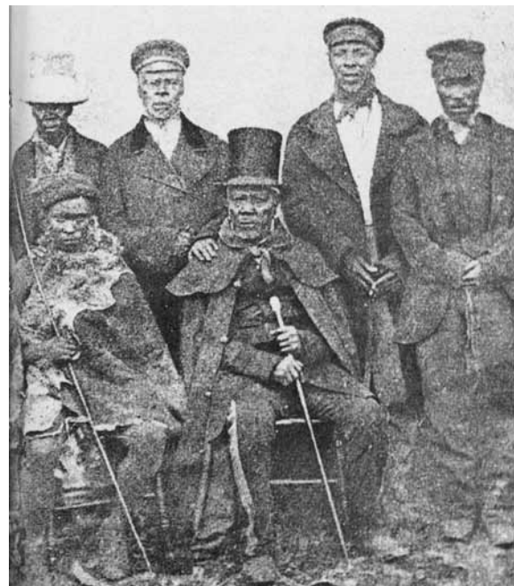
King Moshoeshoe of the BaSotho (1786-1870) with his councilors. After repulsing the British and then the Boers, Moshoeshoe lost extensive territory to the Boers in new attacks. Moshoeshoe eventually turned to the British for protection in 1867. See Basutoland on the map (now Lesotho), an enclave within South Africa.

That tells you how difficult our struggle is. In all other countries, they left, but