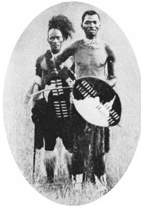
Bambatha, a Zulu chief, led the last military action against the British occupation forces, in 1906. Here, Chief Bambatha (right) and an attendant.

In 1829, January, Maqoma raids Bawana, a Thembu chief, forcing the latter's followers to flee across into territory seized by the colonialists. Stockenström got the expulsion of Maqoma from the Kat River Valley and establishes a settlement for landless Khoi, to create a buffer zone between the Xhosa community and white settler farmers, and to consolidate territories seized by the colonialists. Maqoma responds by increasing cattle raids on white farmers, forcing them to informally