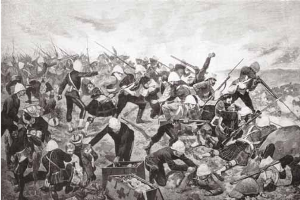
The British could not tolerate the existence of the Boer republics and provoked the First Anglo-Boer War against the South African Republic (Zuid-Afrikaansche Republiek, shown as Transvaal on the map), 1880-1881. Here, the British attack the Boers at Majuba Hill in 1881. The Boers prevailed, but conceded defeat in the second war, 1899-1902, and turned to political methods against the British.

sent a very clear message that the methods we have been using so far did not work, to make us defend our land. And made our forebears take a decision to fight differently, to use the political methods to fight, because land had been taken. This was a very serious situation, because in a clash between the Afrikaners and the British that led to the Anglo-Boer War, as it was called then, the main thing is that the land had become a big issue for the British. They did not want Afrikaners to have what you call the republics [the South African Republic and the Orange Free State], without them controlling. And that's why that war occurred.