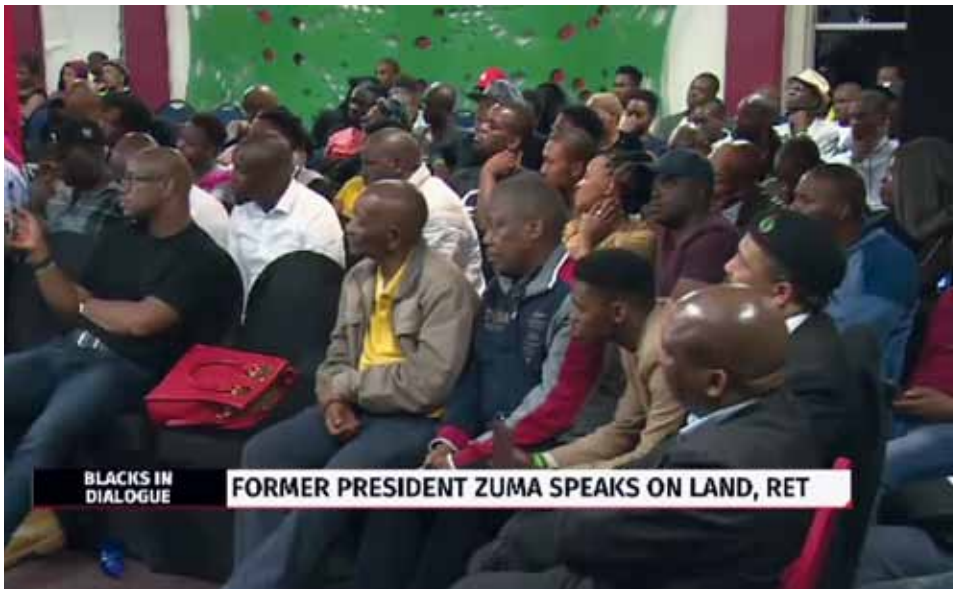
A portion of the audience at the event, sponsored by Black First Land First.

Mr. Zuma's remarks do not, however, bring the history forward to the present moment, in which a British puppet, Cyril Ramaphosa, has been installed in the Presidency. But as London and its thugs and pawns in South Africa fear, that is likely to come, as the global fight intensifies. In the meantime, anti-Empire patriots in