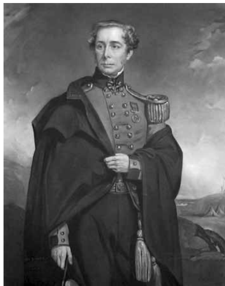
General Sir George Cathcart, governor of Cape Colony, attacked the BaSotho people under King Moshoeshoe in 1852.

In 1837, voortrekkers [Afrikaners moving from Cape Colony to the interior to get free of British rule] under the leadership of Hendrick Potgieter defeated the Ndebele under Mzilikazi at the Marico River, and seized vast tracts of land between the Limpopo and Vaal rivers. It must be noted that Mzi-