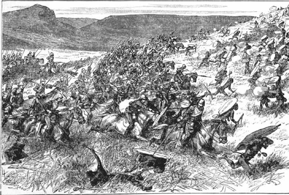
The Battle of Ulundi, 1879. After their defeat at Isandlwana, the British attacked the Zulu anew at Ulundi, with a changed and reinforced order of battle, and prevailed. They captured and deported King Cetshwayo and broke up the Zulu kingdom into 13 chiefdoms.

Zuma: Willing buyer, willing seller. It did not work in the 24 years [since majority rule began in 1994], sufficiently. And we need to agree, rather than to say, “No, no. This can’t happen; it’s wrong.” Because you make us think about this history, and to ask, then, what must we do? [applause]