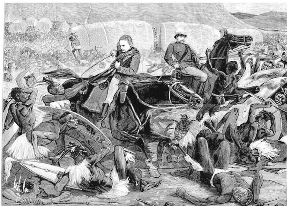
Illustrated London News, 1879

The British invasion of Zululand (north of Natal, see map), in 1879, led to the Battle of Isandlwana, in which the Zulu inflicted a humiliating defeat on the British. Here, two British officers retreat from the battle (seen faintly in the background). Of 57 British officers, five survived. The British lost a thousand rifles, their two field artillery guns, 400,000 rounds of ammunition, most of the 2,000 draft animals, and 130 wagons.