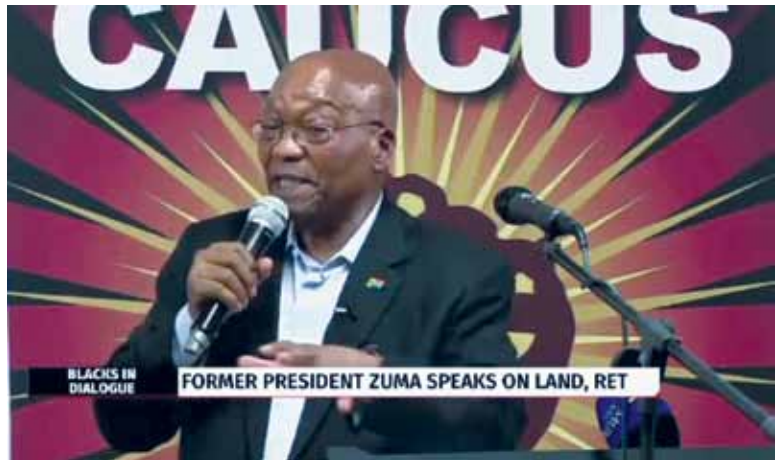
Former President Jacob Zuma delivers his address on April 21.