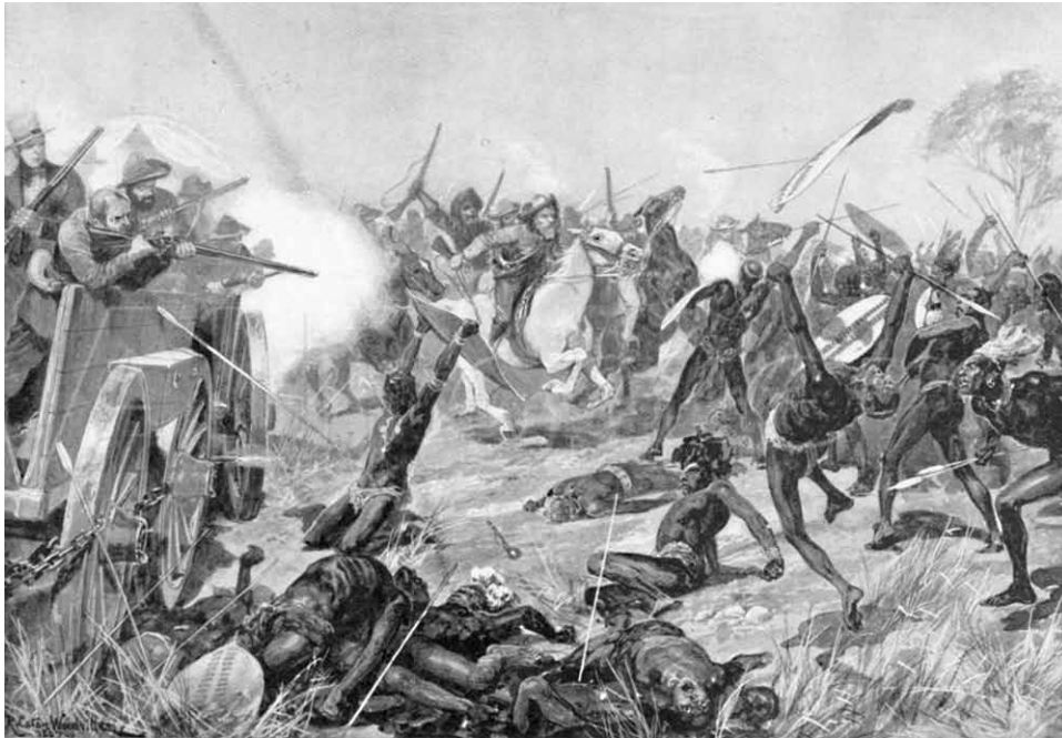
The Battle of Blood River, 1838. Voortrekkers, led by Andries Pretorius, defeated the Zulu at the Ncome River and took possession of the area from the Tugela River to the Umzimkulu, to form the Republic of Natalia. In 1844, the British threatened Natalia and then took it over, renaming it Natal (see map).