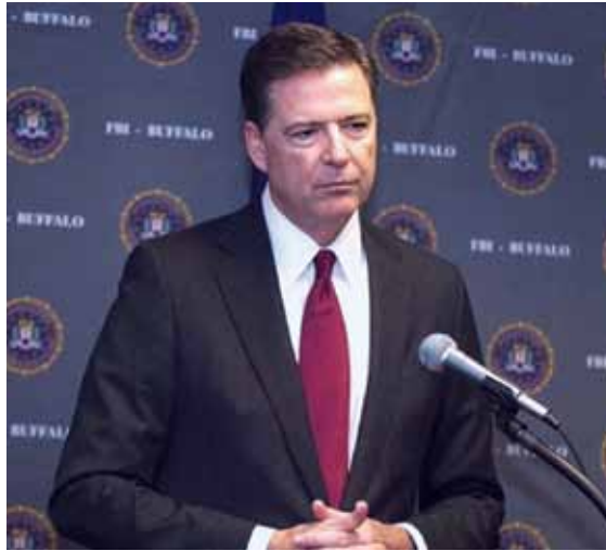
James Comey, former FBI Director.