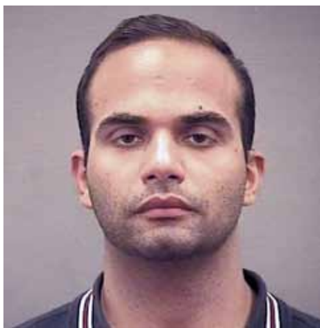
George Papadopoulos, young Trump campaign staffer stalked by Ambassador Downer.