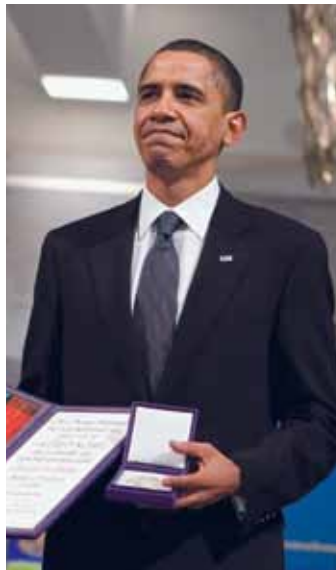
Killer Barack Obama receives the Nobel Peace Prize in 2009.

No, it is Obama and his ilk we must fear, because they seek to deceive people into believing that there just might yet be a way to save their sinking selves within the existing paradigm, when this is impossible. They divert people from the true tasks at hand, as they vainly attempt to disrupt and delay the process of revolutionary change, so that their masters might have a chance (as they imagine) to put in place what is needed to slaughter their potential opponents.