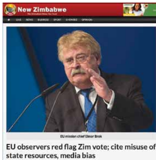
Elmar Brok, German European Parliament Member. He was the only Zimbabwe election observer to claim election irregularities.