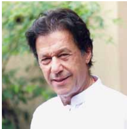
Imran Khan, Pakistan's new Prime Minister.