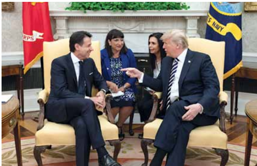
President Trump (right) in bilateral meeting with Italian Prime Minister Conte at the White House, Washington, D.C., July 30, 2018.