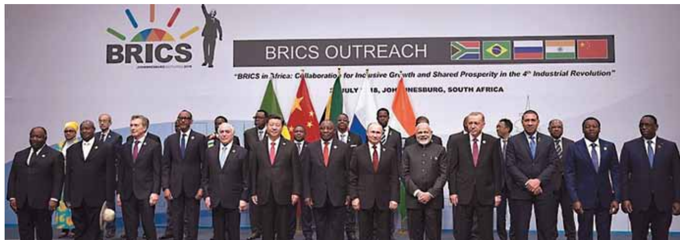
The leaders of the BRICS (front row) and their Outreach guests at the annual BRICS Summit, Johannesburg, South Africa, July 25-27, 2018.

This is creating completely different conditions for those nations involved, so that many conflicts which had seemed unresolvable, are now being worked out in a peaceful manner. I’ll give you just one example: Pakistan’s new Prime Minister, Imran Khan, has now said that Pakistan will follow the Chinese model; he also said that he wants rapprochement with India. For every positive step India makes in respect to Pakistan, he is willing to take two steps. So there is actually, for the first time,