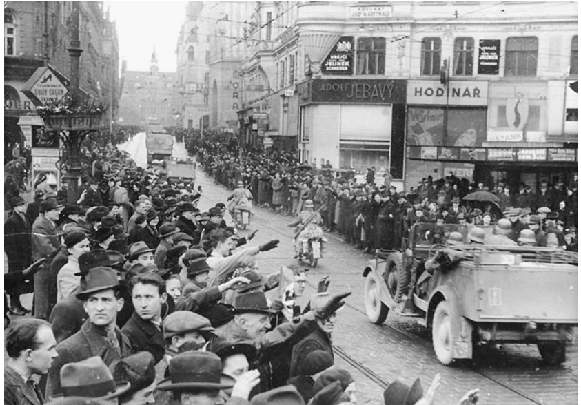
The German Wehrmacht entering Czechoslovakia's capital Brno on March 15, 1939.

and the Baltic States seized by the Red Army in 1944-1945. In doing so, the Russian President reconstructs from the original records what actually happened from 1933 to 1941. He states that those individuals who voted for the EU Resolution are “People who don’t know history. They can’t read or write.”