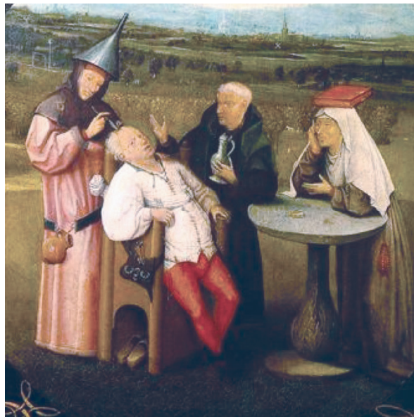
“It is by stimulating the individual’s creative potentialities that neurotic impulses are most efficiently checked.” Extraction of the Stone of Madness by a follower of Hieronymus Bosch or his workshop, 1501-1505.

At the point represented by his late major compositions, notably the string quartets, Beethoven had not only made a revolution in counterpoint, he had expressed thus the discovery of a general principle of musical composition. This example contributed directly to the generation of great composers whose talents were formed during the first half of the 19th century. Schubert, Mendelssohn, Berlioz, Liszt, Brahms, Wagner, Verdi typify the assortment of greater and lesser moons who radiated the sunlight of Beethoven’s genius. These figures, together with the continued reflections of Beethoven, produced the gifted Hugo Wolf, the self-aborted genius of Gustav Mahler from the second half of the 19th century. Then, during the 20th century, the capacity for composing music died, together with the death of poetry and the decay of drama. Although Beethoven’s immediate successors reflected both the direct influence of Beethoven and the favorable circumstances of the spirit of the age of their youth, the genius of Beethoven was not deliberately conceptualized beyond the point represented in particular by the musicologist Schenker. In general, musical theory has misapprehended the essential features of the late Beethoven, with the same included folly exhibited by incompetent learned opinion respecting René Descartes’ notion of universal perfection.