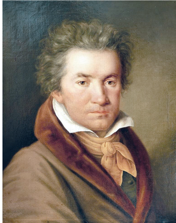
Painting by Willibrord Joseph Mähler, 1815 Ludwig van Beethoven

It is also a fact that the lack of similar disposition among encountered gifted persons correlates with a characteristic sour note in their internal mental discipline, a certain shallowness. A person who enjoys "rock" or prefers romantic "kitsch" is invariably a moral mediocrity under closer scrutiny. Romantic musical "kitsch" belongs to the department of the bellylaughs after the third or fourth beer, the second bottle of wine. Such moments occur in the life of the creative person, but they occur as "other moments." The person who lacks the habit of great art, the habit of profound excitement in the experience and contemplation of great art, is a deprived, diminished person. Opposite to such deprivation and self-deprivation, knowledge of