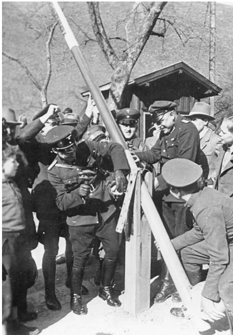
German and Austrian border police dismantling a border barrier on March 15, 1938.

In his speech to the CIS conference, President Putin begins by referencing that anti-Russian EU Resolution. He states that the Resolution prompted him to learn the truth of the matter. He says: