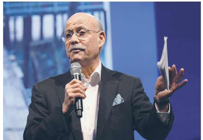
CC/World Travel & Tourism Council

Only a meager 17 pages of the 250-page book are devoted to a "solution" to the crisis, and what is presented remains unclear and questionable. The proposals are at best partial solutions, with some good ideas here and there, but they are overall so contradictory that one suspects that either the authors do not understand the nature of the crisis at all, or worse, that their proposed solution will act as an accelerant for the financial and economic storm as it finally crashes into the wall. The chapter in which the "solution" is formulated, is titled, "Powerhouse Europe," and, revealingly, it opens with a