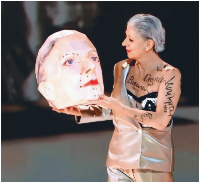
Portrayal of Leonora in the Darmstadt performance of Fidelio.

sense, of a historical event, namely the liberation of the hero of the American Revolution, the Marquis de Lafayette, the French Republican, by his wife Adrienne. This reflects Beethoven's own republican sentiments, which included at that time of feudal structures and Napoleonic campaigns, both personal courage and the desire for freedom.