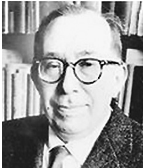
Leo Strauss, protégé of Nazi jurist Carl Schmitt, and professor of political science at the University of Chicago (1949-69).

Because the great issue for the twenty-first century—far more important than even Muslim terrorism—is the question of whether China will become a democratic country.... You are the pathfinders for democracy in China and therefore keepers of the hope for the world and for the 21st century.