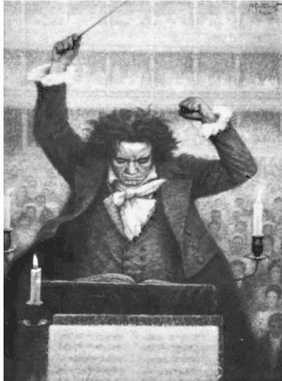
Painting by Michel (Mincho) Katzaroff

language. The relationship of language to the individual’s consciousness-in-general, the individual’s conscious and preconscious notions of social identity, makes music the most social of the art forms. Within music generally, song and opera have the advantage of immediately subsuming drama and poetry. Song is the