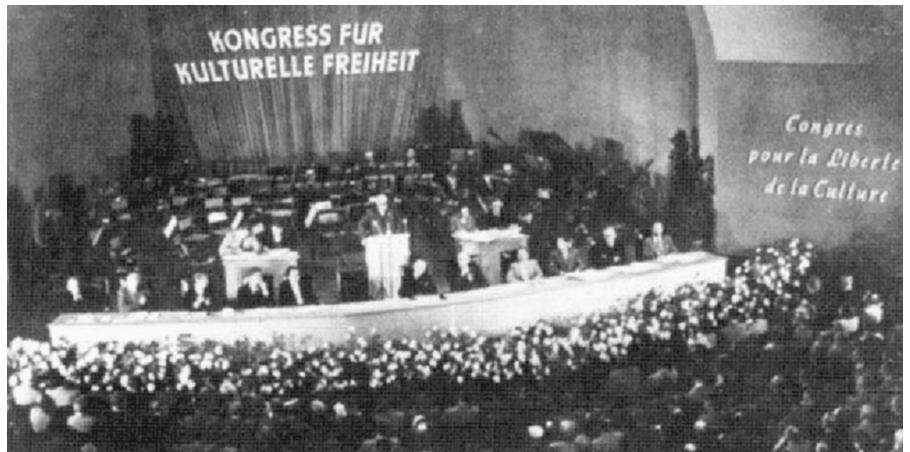
The first Congress for Cultural Freedom convention, Berlin, 1950.

In contrast, the National Socialists' image of man, with its blood-and-soil ideology, is based on a racist, chauvinistic and Social Darwinist conception of the superiority of the "Aryan" race. To claim that because both the classics and National Socialism occurred in Germany, there is an inner connection between these dia-