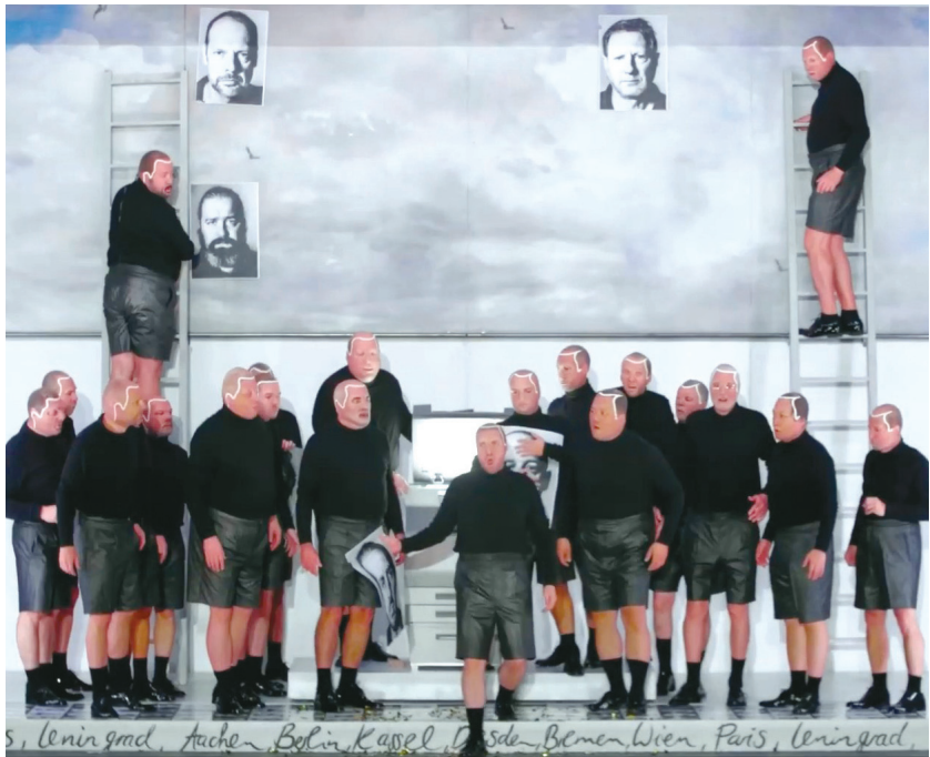
A scene from the Darmstadt performance of Beethoven's Fidelio .

When listening, I often imagined that I was sitting at the controls of a mixer console and turned up the speed. And then I would just assume that Beethoven, when he composed, almost intended to go too far and fast. It's really exulting! It reminds me of children who go crazy with excitement because they don't know how to keep their emotions under control.