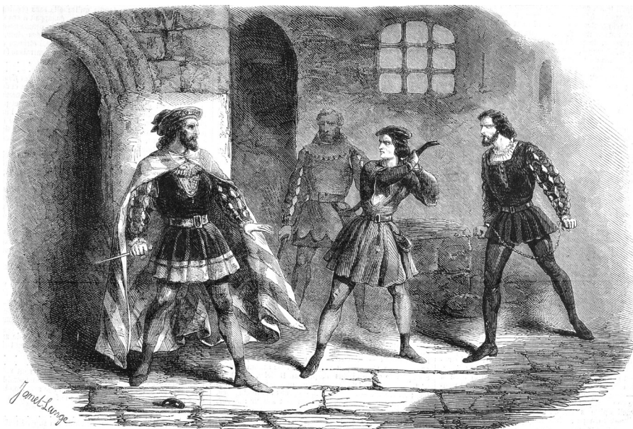
Illustration by Ange Louis Janet, 1860

One might say of the cinema and TV screen that, unfortunately, the medium has tended to become the message. The fact that singers can perform fellatio on a microphone before thousands of cheering spectators has apotheosized heartburn into a salable product. The