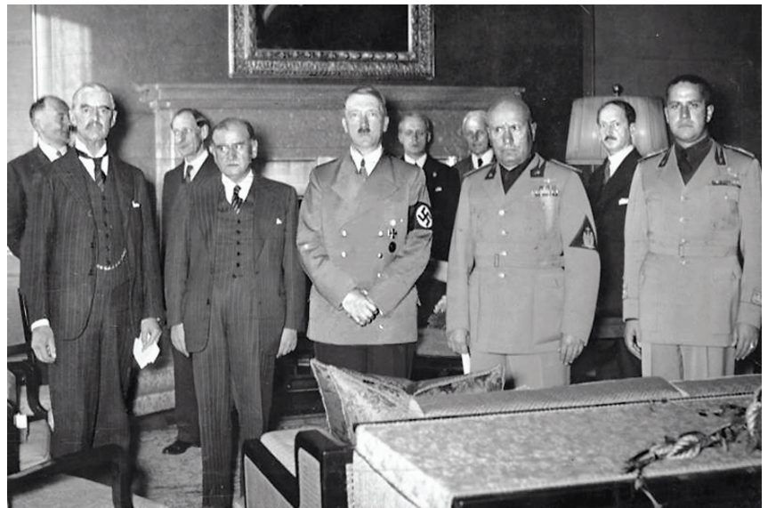
Adolf Hitler and UK Prime Minister Neville Chamberlain in Bad Godesberg, on September 22, 1938.