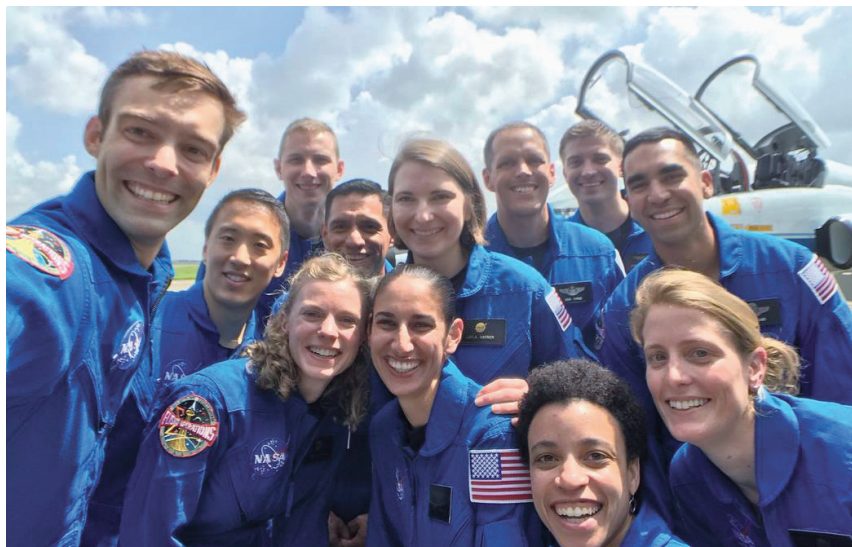
Conor A Nixon@Shamrocketeer

Meet the Artemis generation astronauts: The seven men and five women in NASA's 2017 class of spaceflight trainees, the largest in two decades.