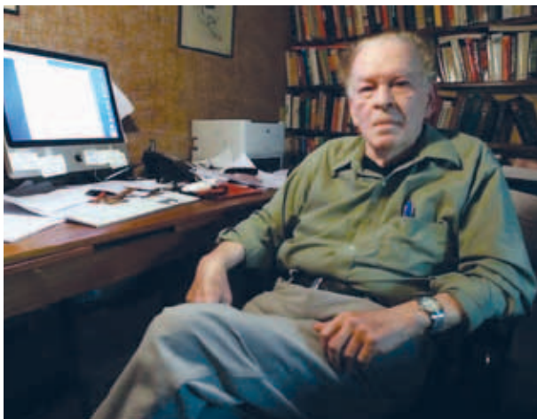
Gene Sharp

Finally, we'll outline further exactly what must be done to upend all of the plans of the transnational elites and win the future for our country. We note that we have a chance now to finally make real the ideas of the American Revolution. If we don't do that, we