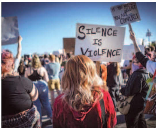
A protest demanding justice for George Floyd in Des Moines, Iowa, May 29, 2020.

So, I propose to tell this story in three parts. First I'll set