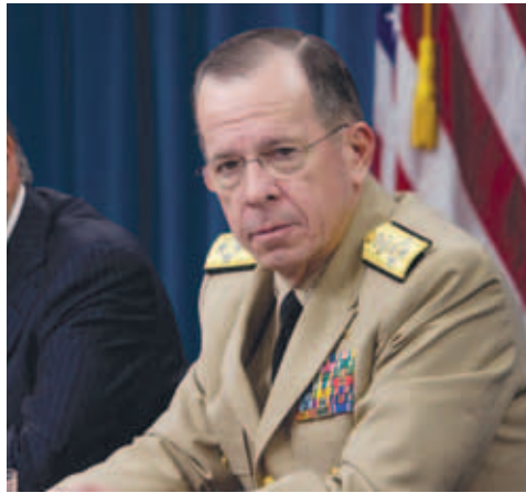
Admiral Mike Mullen, Chairman of the Joint Chiefs of Staff.

Then Obama’s generals started an organizing tour through the Pentagon, organizing current military leaders against using the military to restore order. Make no