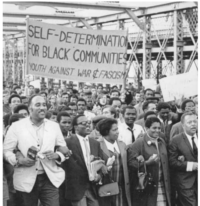
Supporters of “community control,” marching across the Brooklyn Bridge, October 14, 1968.

Dr. King was assassinated precisely because he shifted the civil rights movement to fighting a war on poverty and the lifting of the entire population into the middle and upper classes. The starkest contrast to the program of #BlackLivesMatter, detailed below, is found in the official program of the NAACP in the 1970s. That program fought hard for the expansion of nuclear energy throughout the United States as the precondition for the expansion of the black population and