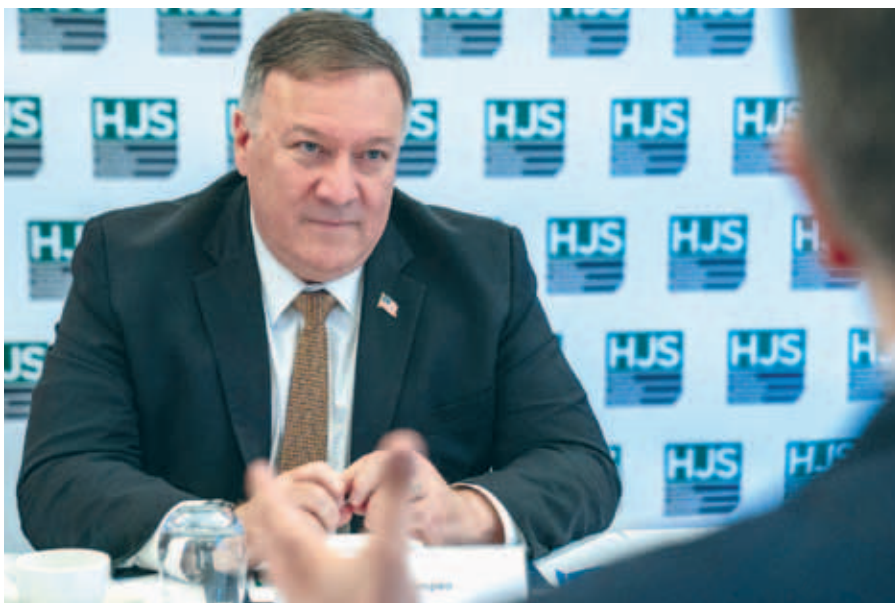
U.S. Secretary of State Michael Pompeo, in a roundtable discussion hosted by the Henry Jackson Society in London, July 21, 2020.

The character of that deep moral insanity, which causes him (reminiscent of British stooge Barack