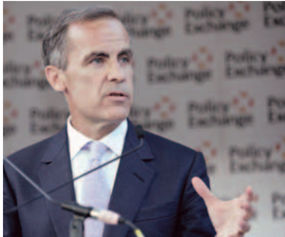
Mark Carney, former governor of the Bank of England, and oligarchical spokesman for the “Green Agenda.”

The financial diktat from Carney was quickly supported by Michael Bloomberg, then a pop-up candidate for the Democratic nomination for President, as the two teamed up to promote the global, radical imposition of “Green Agenda” economics—policies that would slash economic productivity and reduce living standards (and the potential population level). While many features of their propaganda campaign were clownish, 4 what must not be ignored is that