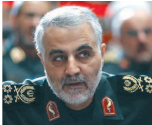
Iranian Gen. Qasem Soleimani, assassinated at the Baghdad airport on January 3, 2020.

the zombies of doom in the financial community had dropped their masks, and in fact admitted that they are completely committed to murderous policies of preventing physical economic development, worldwide, in order to keep their financial power.