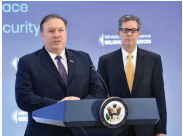
Pompeo with Sam Brownback, “Ambassador at Large for International Religious Freedom.”

Since 2018, when Brownback was appointed by Trump to a bizarre position called “Ambassador at Large for International Religious Freedom,” a position Brownback invented in a bill he passed right before retiring from the U.S. Senate, Pompeo and he are known to coordinate. One can find them, for example, hopping around conferences in Washington, D.C., where Brownback will have assembled terrorists and anarchists he gathers from all over the world, claiming they are being persecuted for their faith, whom they will even inflict personally on Donald Trump with visits to the Oval Office. Brownback’s shenanigans on this matter are proven to be fraudulent when compared to serious interventions that have been undertaken by clergy and other patriots, who have worked with Russia and China