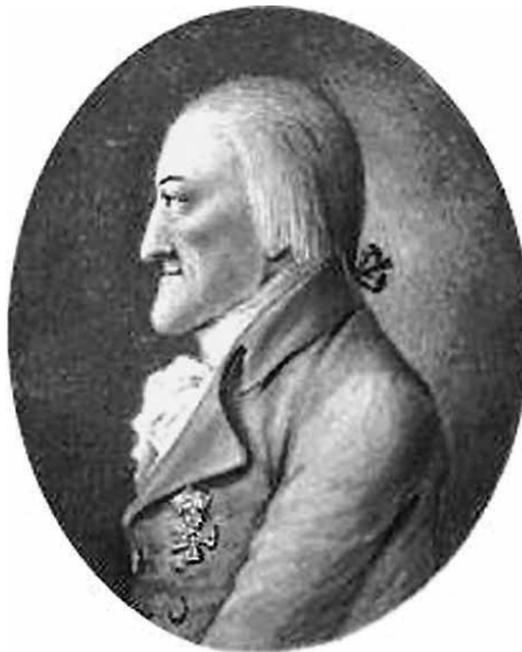
Johann de Paula, Baron of Thugut