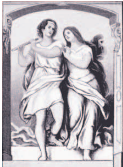
Tamino and Pamina from W.A. Mozart's opera, The Magic Flute , portrayed in a fresco in the Vienna State Opera House.

While Bonaparte, under pressure from America, had been instrumental in 1797 in getting Lafayette freed, he had also spent the next seven years assiduously keeping Lafayette out of French politics. Then in May 1804, Napoleon promoted himself from "First Consul" to "Emperor." Beethoven's close friend, Ferdinand Ries, who was the first to tell Beethoven the news, reported that Beethoven famously ripped out the title page with its dedication to Bonaparte, declaring: "So he is no more than a common mortal! Now, too, he will tread under foot all the rights of Man, indulge only his ambition; now he will think himself superior to all men, become a tyrant!" The symphony was eventually published, in 1806, as the Eroica with Beethoven's terse notation: "Composed to celebrate the memory of a great man."