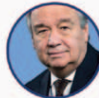
Antonio Guterres The ninth Secretary-General of the United Nations