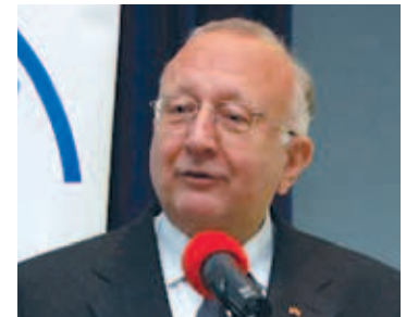
Karl-Theodor-Molinari-Stiftung Willy Wimmer