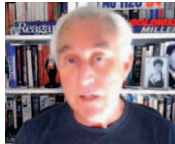
LaRouchePAC-TV Roger Stone