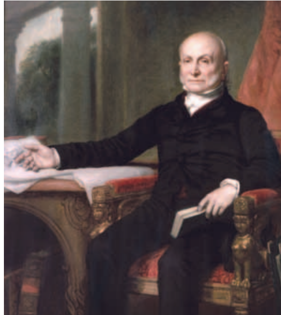
George Peter Alexander Healy

It's very important not to capitulate, not to be intimidated by this incredible apparatus, but to really be courageous right now—like my husband was! He was a presidential candidate eight times: He got close several times to making a major breakthrough. They stole the votes every time from him! Did that mean that he gave up? Absolutely not! Because he knew what he was fighting for, was the soul of America and the good of the entire human species, and that is agapē , the love for humanity which you have to mobilize in yourself right now.