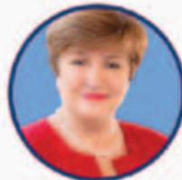
Kristalina Georgieva Managing Director, International Monetary Fund