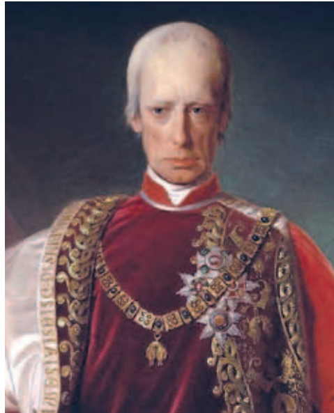
Friedrich von Amerling, Emperor Franz II of Austria.

Adrienne Lafayette herself had been imprisoned by the French radicals in late 1792—shortly after her husband had been imprisoned by the anti-French, reactionary Coalition. She was still there in July 1794, when her sister, her mother, and her grandmother were taken from her one day and guillotined. She only escaped the same fate due to pressures exerted by America—from George Washington via his representatives in Paris, Gouverneur Morris and James Monroe. When finally released, a few months after the fall of Robespierre and the subsidence of the Terror, she proceeded to organize a personal confrontation with the Austrian Emperor, Francis II—demanding that he release her husband or that he imprison her in the same dungeon. Her willingness to go back into prison saved Lafayette.