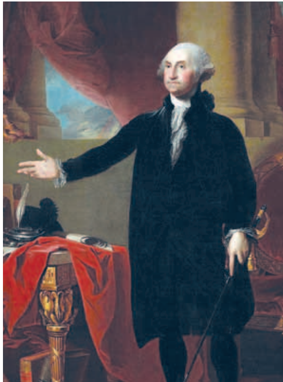
George Washington in 1796.

Hamilton served as the link between the official and unofficial operations to free Lafayette. Officially, Hamilton coordinated updates for, and deliberated with, Washington—which resulted in both the Marshall mission to Prussia's King Friedrich William II (see below), and a private letter to Emperor Francis II. However, even in these two cases, Washington was appealing as a private citizen and friend of Lafayette, not as the official action of the United States government. Washington and Hamilton worked from Philadelphia, along