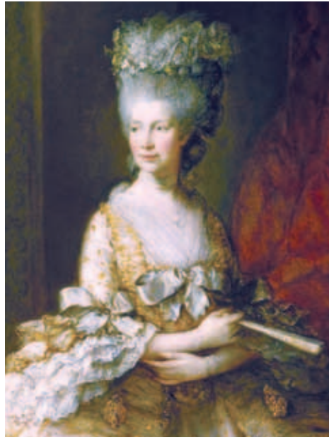
Queen Charlotte, wife of King George III.

neutral area. At first, the captain of the guard there granted the normal rights of transit for the group. Then Lafayette's presence was noticed, and the normal rules and procedures went out the window. The group was detained and put under guard. Count Franz von Metternich, the chief minister of the Austrian Netherlands, asked Vienna for instructions, while Lord Auckland, the British envoy to The Hague, notified Lord Grenville, the Foreign Minister.