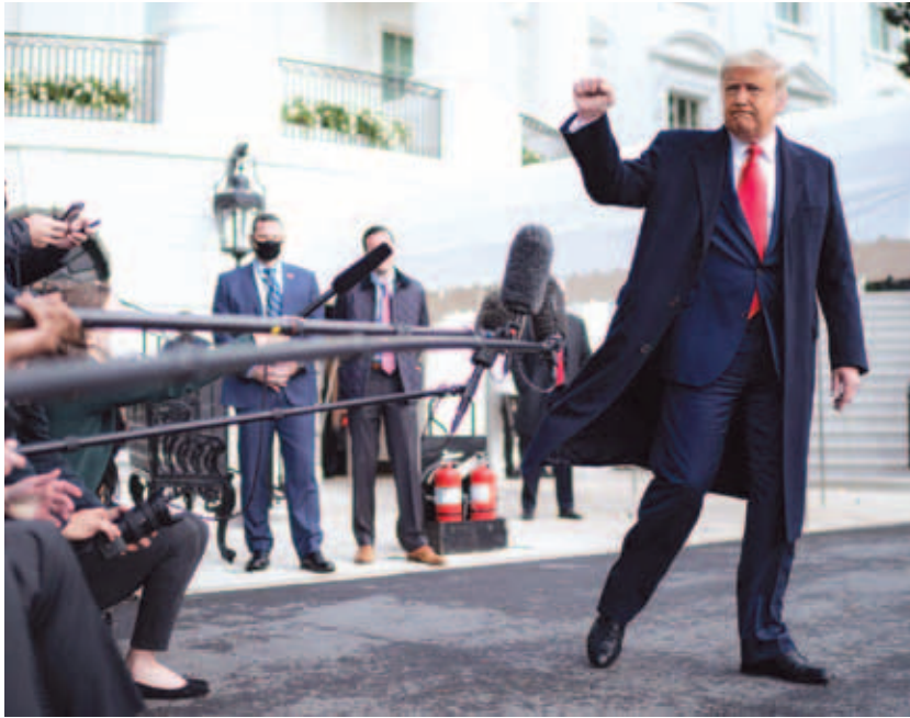
White House/Tia Dufour