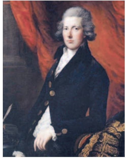
Prime Minister William Pitt, the Younger.

On August 26, George III's wife, the British Queen Charlotte, in a letter to her son, gave the game away: "Wee see the very man who wanted to crush England, proves the curse to his own country, & I am sure he will meet with his reward." 5 She could be sure of this because their Prime Minister, William Pitt, made it a top priority over the next five years to so reward Lafayette. All the while, Pitt repeatedly claimed that the British Crown and government were uninvolved, having no interest in the unimportant Lafayette one way or the other.