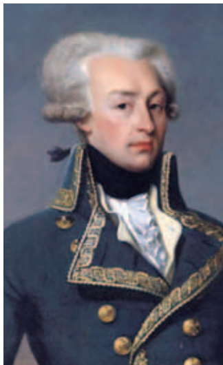
Joseph-Désiré Court, 1834 Gilbert du Motier, Marquis de Lafayette

This year, 2020, is indeed the occasion of the 250th birthday of Ludwig van Beethoven. A lot of his music is being performed. Many are being moved by forces deep within their being, reminding them of the depth and universality of their humanity—accompanied by a marked uptick of honest tears and laughter. That’s lawful. However, Beethoven, similar to his colleague, Friedrich Schiller, viewed his creative work as even more, a moral mission with the power to effect necessary and permanent changes for good in their audiences. The question is posed: Might those temporary experiences of reconnecting to one’s humanity transform the civilization’s thinking from that of an adolescent to that of a mature