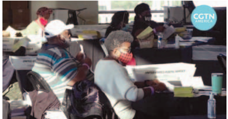
Ballot-counting in Georgia, November 6, 2020.

These things are blatant. They're obvious. And one can only characterize it in one way: That