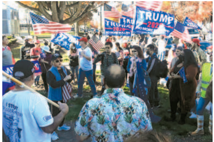
Pro-Trump rally in Trenton, New Jersey, November 8, 2020.