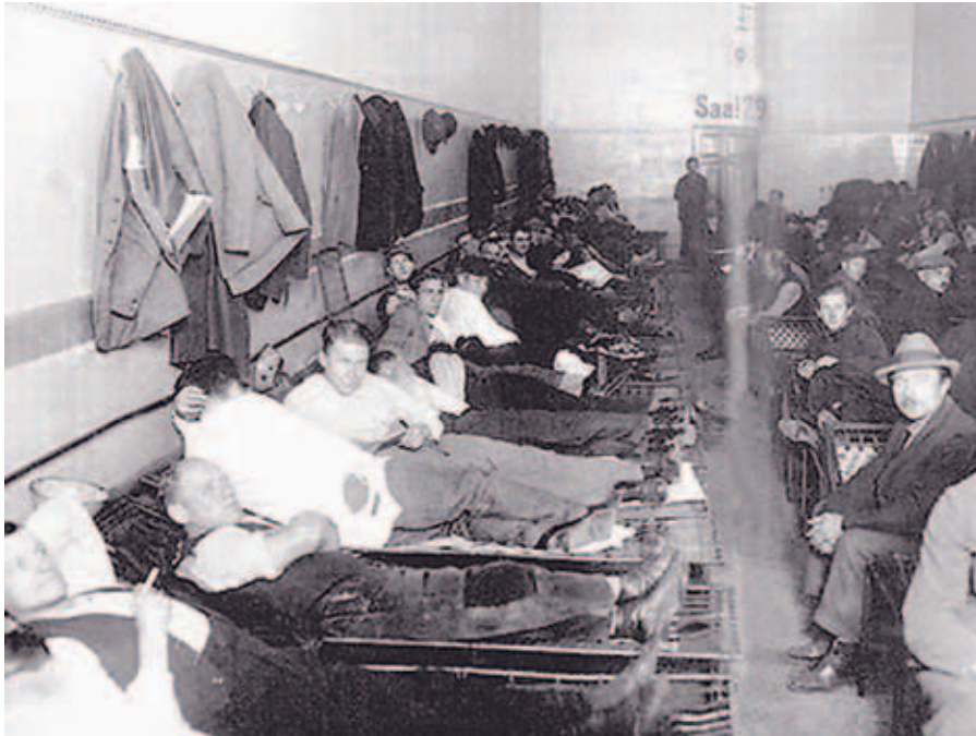
The U.S., under President Obama, is staring in the face of a 1923 Weimar-style hyperinflationary collapse of the economy. This photo shows a refuge for homeless and jobless men in Weimar Germany, following the crash.

Despite all writhings and groanings in protest from Wall Street and London, those are the facts of the matter to be faced, if you, personally, wish to enjoy a prolonged and actually productive and enjoyable life.