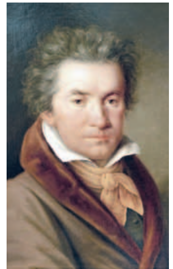
Willibrord Joseph Mähler Ludwig van Beethoven

adult. That is, it may be time to consider an appropriate birthday gift for the fellow.