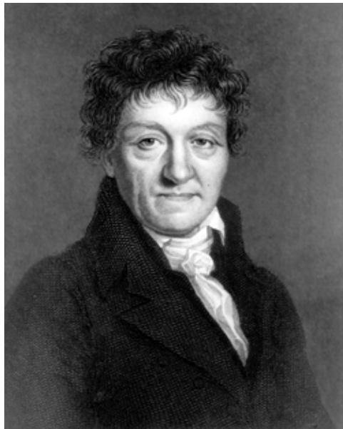
Lazare Carnot, member of the French Directorate.

Beaumarchais had actually written the play in 1791, but its successful six-week run on the Paris stage in the