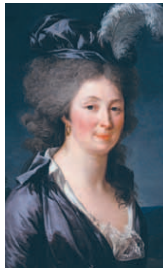
Adélaïde Labille-Guiard Adrienne de Noailles, the Marquise de Lafayette