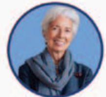
Christine Lagarde President of the European Central Bank

wide green “Marshall-like plan” to decarbonize the behavior of consumers, businesses, agriculture, investors, and all.