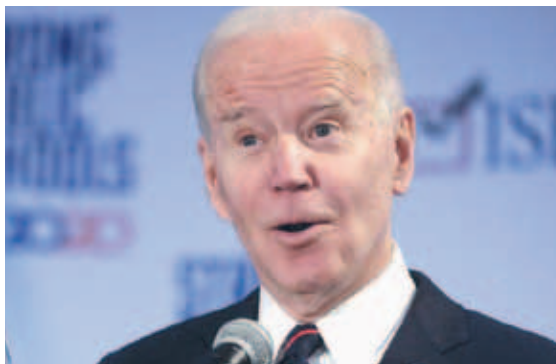
Media-declared “President-elect” Joe Biden is part of a psywar operation telling us that resistance is futile.

If it isn’t clear to you by now, these are the people who actually own the Democratic Party in the United States, lock, stock, and barrel. This is Bloomberg; Mark Carney from England, who’s running this through BlackRock; this is Google, with Eric Schmidt. This is [New York Governor] Andrew Cuomo, who said exactly the same thing: “We’re going to reimagine the state of New