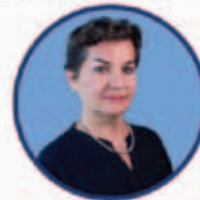
Christiana Figueres Founder, Global Optimism