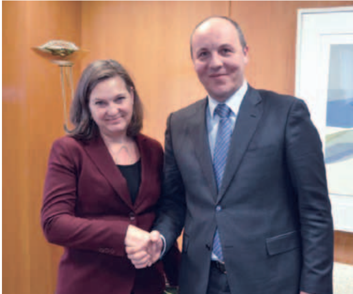
Embassy of Ukraine in Washington

Victoria Nuland, former Assistant Secretary of State for European and Eurasian Affairs, shown with Andriy Parubiy in Washington on February 26, 2015. Parubiy was rewarded with the chairmanship of the Ukrainian parliament for leading actions against the legitimate government in the 2014 coup.