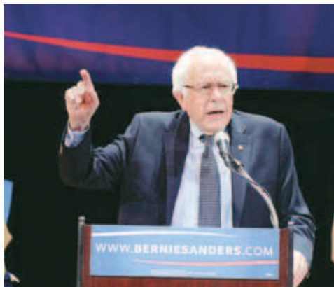
Bernie Sanders, candidate for the Democratic nomination, was defrauded by his own party in the Iowa caucuses.

At the press conference, as significantly, Biden announced that what his mandate was, was for the Green New Deal, his approach to COVID, and overcoming systemic racism. Today, when Rudy Giuliani was trying to hold a press conference about how every Republican poll watcher was effectively barred from the polls in Philadelphia and Pittsburgh, despite a court order allowing them