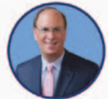
Larry Fink Founder, Chairman, Chief Executive Officer of BlackRock, Inc