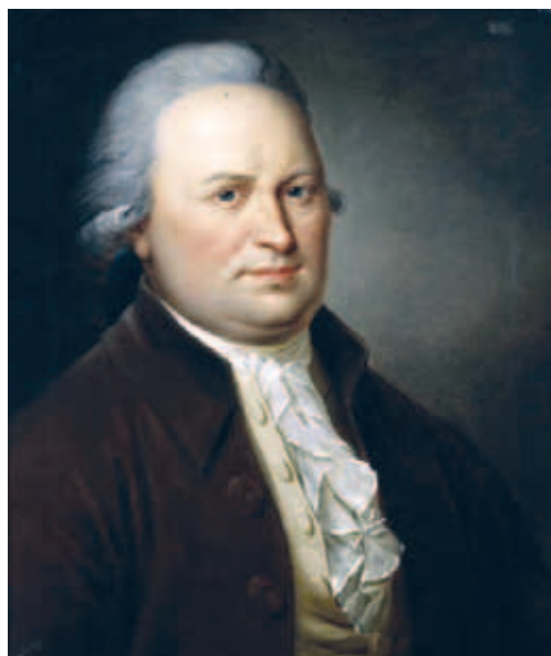
Friedrich Georg Weitsch Johann Wilhelm von Archenholz in 1789.

A large portion of the publicity was done by Baron Johann Wilhelm von Archenholz. The February 1793 issue of his Minerva magazine featured his major article on Lafayette’s situation. It was smuggled into Lafayette’s cell in Magdeburg, providing much-needed moral support. (Archenholz’s magazine was a major source of political events for German-speakers, probably including for Beethoven.) Lafayette’s response to Archenholz, smuggled out by an unidentified American with the help of a prison guard, was the first the larger world heard from him, published after more than six months of imposed silence: