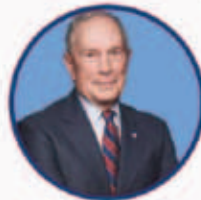
Michael R. Bloomberg Founder, Bloomberg LP & Bloomberg Philanthropies