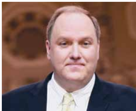
John F. Solomon

operation, Rudy Giuliani and John Solomon, were viciously harassed and sidelined, casualties temporarily, at least, in this war. Yes, the President's poll numbers soared as people protested and were outraged by what was taking place. But ask yourself, has the nation advanced from any of this? Has the presidency been secured?