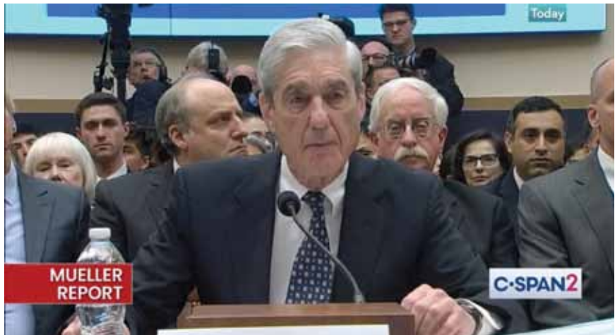
Robert Mueller. He failed to destroy Lyndon LaRouche and failed to destroy Donald Trump.

Now, I am telling you this not because I want to paralyze you with fear of something that is all powerful. It is not. In fact, right now it is drastically weakened. The apparatus that Lyndon LaRouche fought is now being fought on the plane of the U.S. Presidency itself, with all of the powers of declassification, appointment, and investigation, to finally defeat this enemy. But we can only do so if it is understood what this enemy is and what its vulnerabilities are, and if we resist, at all costs, any ideas that we can be pragmatic, or lazy in our thinking or mode of operation, substituting slogans for an actual strategy. They have made it plain, either they get taken out by legal means, or you get taken out by any and all means, including those which are lawless.