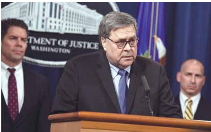
Attorney General William Barr.

In reality, Roger Stone is a piece on the chessboard—now being played in a desperate effort to pre-