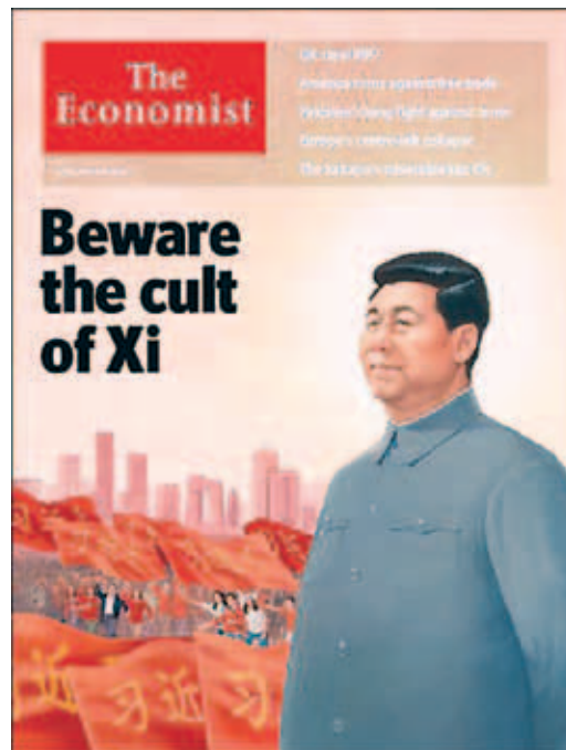
The Economist, April 2, 2016.

Yet by instinct Mr. Trump is not a conventional hawk, if hawkishness is defined as objecting to the principles that guide China’s modern rise, from its authoritarian political system to its embrace of state capitalism, in which the government’s deep pockets and legal powers are used