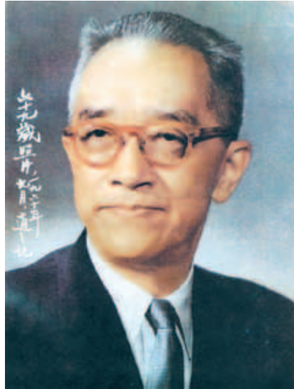
Hu Shih in 1960 (above), and with his teacher John Dewey, between 1938 and 1942.