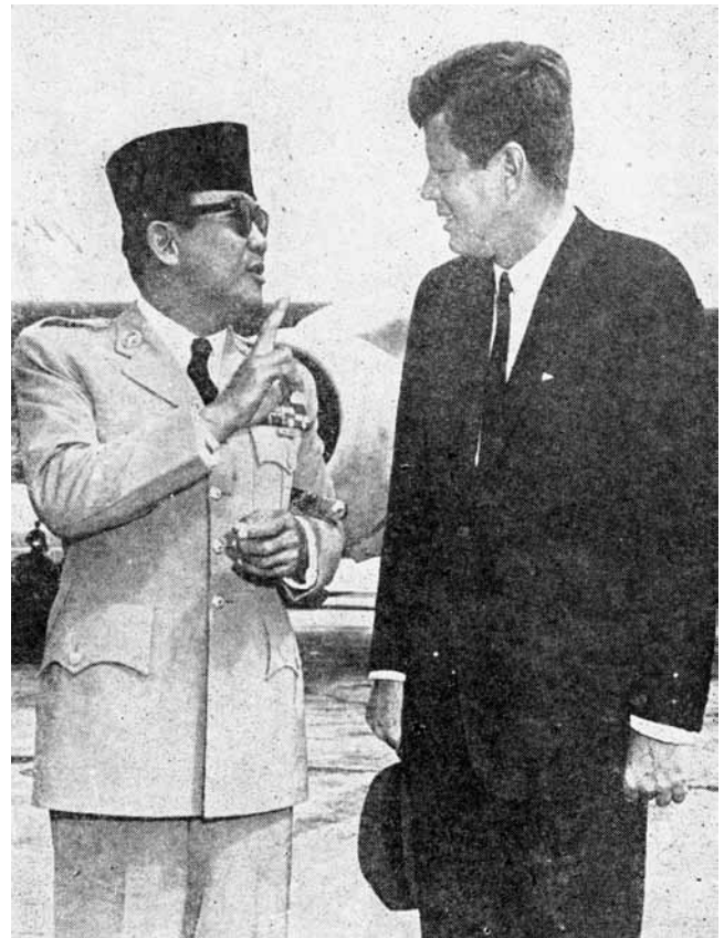
President John F. Kennedy refused to accept the idea that every nationalist fighting against the colonialist powers was necessarily a communist enemy of the United States. Here he is welcoming President Sukarno to the U.S. in 1961.

This was the basis for what became the Non-Aligned Movement, and the key purpose was stopping a war. Zhou Enlai pledged that China would not support insurgencies in places like Thailand. They would support na-