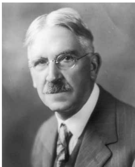
John Dewey, "a fierce opponent of Classical education," was one of the most destructive figures in American history.