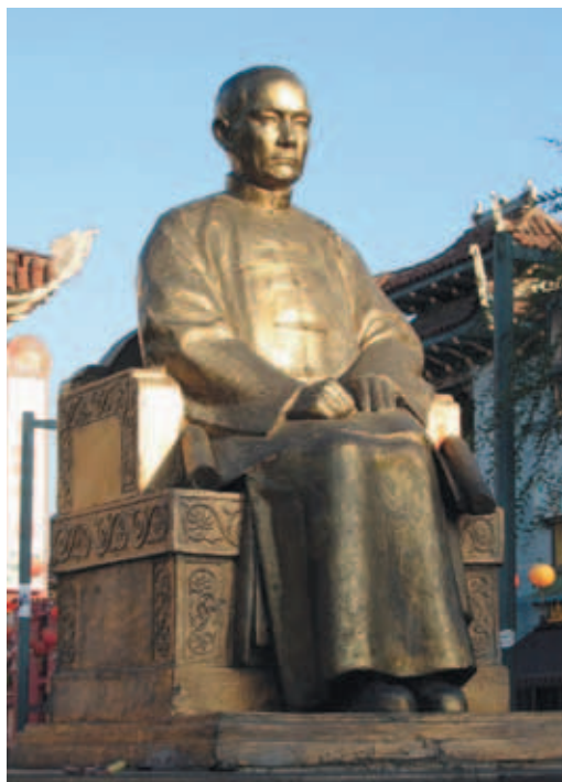
Dr. Sun Yat-Sen, trained in American System economics, led the 1911 revolution that overthrew the Qing Dynasty and ended the Imperial System in China. Shown: A sculpture of Dr. Sun Yat-Sen in Chinatown, Los Angeles, California.

Sun Yat-Sen had warned that if China joined the war on the side of the British, then even if the British won, China would not join in the benefits of victory, but would be chopped up and passed out to others,