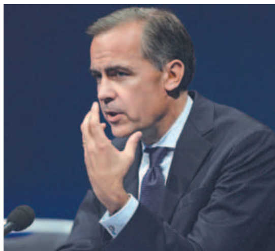
Mark Carney, former Governor of the Bank of England, and currently UN Special Envoy on Climate Action and Finance.

Bill Gates, who Cuomo said would handle education in