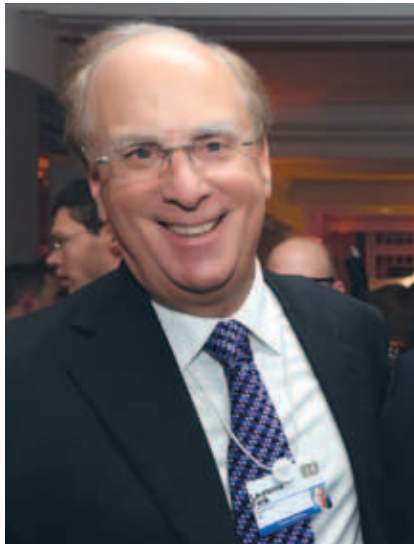
Larry Fink, BlackRock CEO.

The globalists themselves appear to recognize that COVID-19 had rung the bell on a system which was already dying a natural death. Prior to COVID-19, the world's leading transnational oligarchs were already proposing that the next stage of globalization must be a bankers' dictatorship, eliminating political nuisances such as the U.S. President and the nation state, entirely. Blackrock's Larry Fink had made just such a proposal at the Economic Policy Symposium at Jackson Hole, Wyoming, in August of 2019. Fink's pal, Mark Carney, the former Governor of the Bank of England, the man considered to be the world's most powerful central