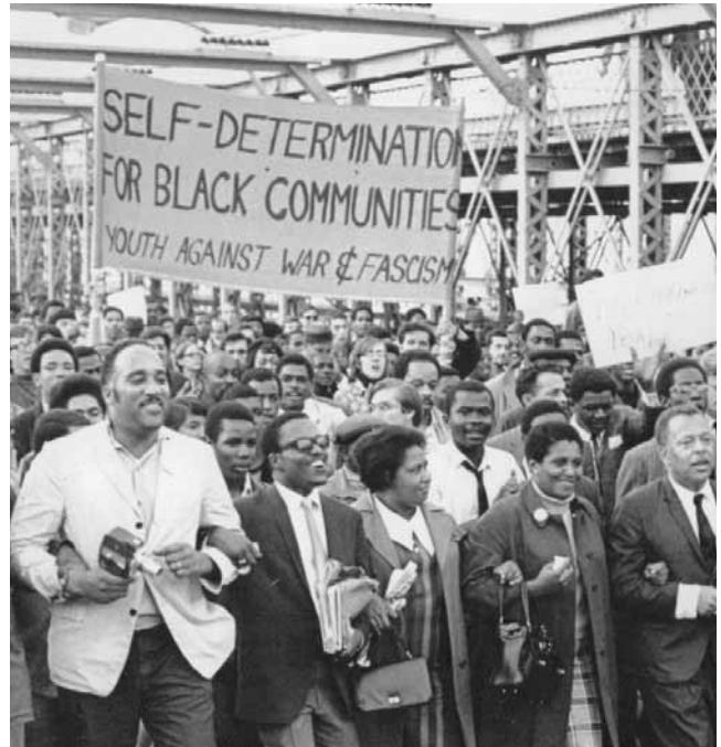
Supporters of “community control,” marching across the Brooklyn Bridge, October 14, 1968.

Dr. King was assassinated precisely because he shifted the civil rights movement to fighting a war on poverty and the lifting of the entire population into the middle and upper classes. The starkest contrast to the program of #BlackLivesMatter, detailed below, is found in the official program of the NAACP in the 1970s. That program fought hard for the expansion of nuclear energy throughout the United States as the precondition for the expansion of the black population and