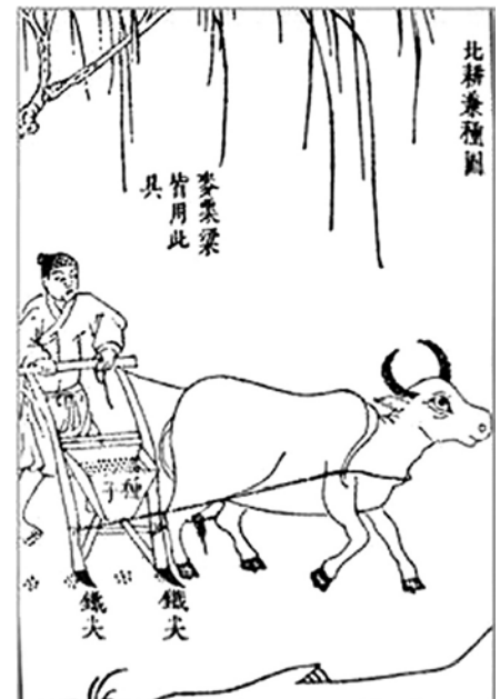
The Chinese seed drill improved agricultural yield by planting seeds in a row at a uniform depth and covering them immediately.