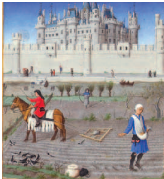
The wasteful and inefficient European planting method, as shown in Paul de Limbourg’s illustration for the month of October in the Duke of Berry’s book of hours, Très Riches Heures du Duc de Berry , c. 1415.