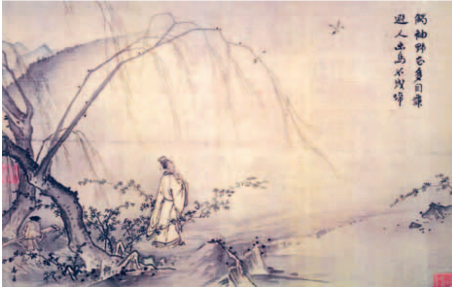
Walking on a Mountain Path in Spring, by Ma Yuan, 13th Century, Southern Song Dynasty.

products of all the hundred crafts. If everyone must make everything he uses, the Empire will be led along the path of incessant toil.