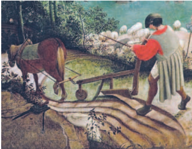
Detail of Landscape with the Fall of Icarus, ca. 1558, by Peter Bruegel the Elder, showing a man plowing with an inefficient European plow.

edge of the blade is vastly greater than the pressure exerted upon the handle of the knife. The power is more concentrated. We measure such concentration of power as increase of energy-flux density.