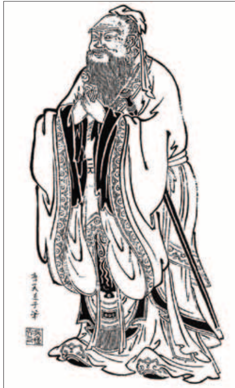
Portrait of the teaching Confucius, by Wu Daozi, ca. 685-758 A.D.

The successes of ancient China in economic development were the result of the influence of the Confucian philosophical school, led by Confucius himself (551-476 B.C.) and his follower, Mencius (372-289 B.C.). Their school of thought, parallel to that of Socrates and Plato in Europe, has served as the driving force for every era of progress in science and the arts in China—including the current one—much as the Pla-