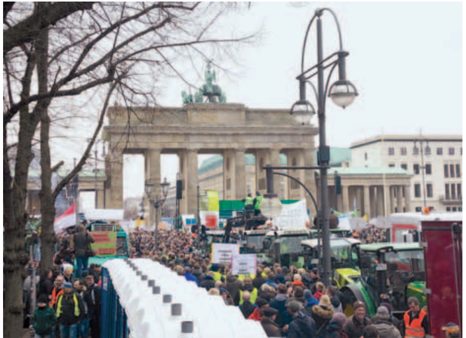
Large farmers' demonstration in Berlin protests government policies that suppress food production, November 26, 2019.

These figures and agencies are not “confused.” They know full well that green finance, and their fake save-the-environment movement, means mass depopulation. The World Economic Forum will officially roll out its “Great Reset” master plan for green finance and killer economic policies, and for replacing sovereign governments with mega-bankers’ “governance” at