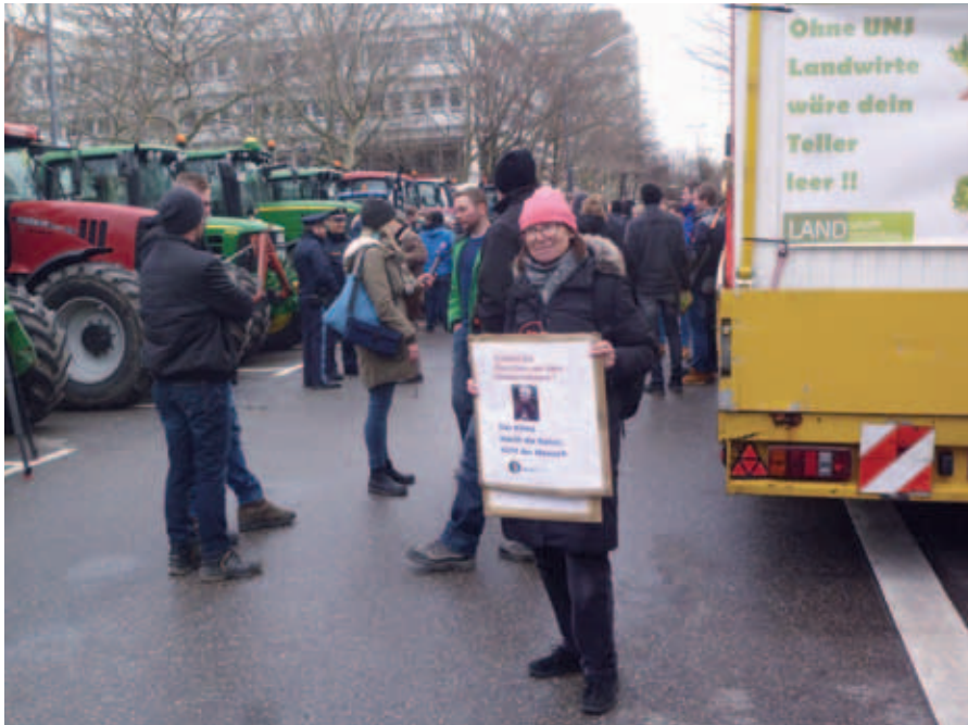
Schiller Institute/Werner Zuse

A demonstration sponsored by Land schafft Verbindung at the Ecology Ministry of Bavaria in Munich, Germany on March 5, 2020. The Schiller Institute organizer's sign reads: "Protect the people from the climate protectors!" and "Climate makes nature, not people."