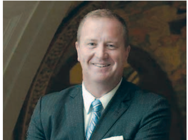
Missouri AG's Office

The Great Reset—described in the report we published some weeks ago and which is now coming out in the form of mass pamphlets in several countries—this is the biggest assault on the living standards and the character of the European nations and the United States as industrial nations, and it will cause complete