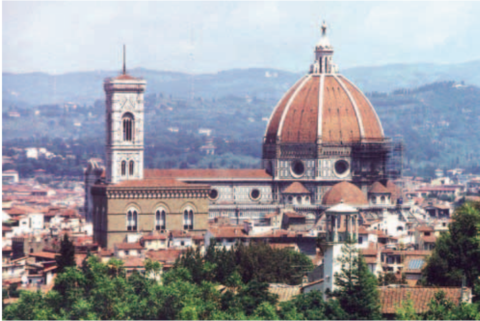
The Fifteenth-Century Renaissance, centered in the great ecumenical Council of Florence (1438-1439), unleashed a rebirth of science, and initiated the modern sovereign nation-state republic. The dome on the Cathedral of Florence (shown here), where the council took place, had just been completed by the great Renaissance architect Filippo Brunelleschi.

Kepler. As I have noted in an earlier report. Niccolò Machiavelli illustrates the crucial points in, especially, his Discourses on the First Ten Books of Livy , where he illustrates the reasons that the emergence of the modern state, including the development of the city, had created a situation in which “traditionalist” feudalist measures could not secure an assured defeat of modern society militarily. The effect of technology on society’s capabilities, meant that the Venetian financier-oligarchy would lose its battle against modern society, unless it made certain Sophistical forms of adaptation to the use of new technologies.