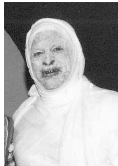
"Unfortunately," writes LaRouche, "Al Gore is not the only fool among our republic's and Europe's political classes." Here, Gore is shown letting his inner monster out at two Halloween frightfests.

operation at the present time, using the follies of the Bush-Cheney war-policy in Southwest Asia, to take the place, for today, of the 1964-1972 phase of the U.S. folly in Indo-China. The leading Anglo-Dutch Liberal faction is moving, currently, to wreck the United States as both an economy and a political power, absolutely, through aid of the effects of the U.S. and British Southwest Asia military adventures, and the rapid wrecking of the U.S. dollar through sinking the pound, temporarily, in a fashion echoing the first Harold Wilson government of the U.K.