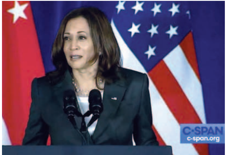
Vice President Kamala Harris made a laughingstock of herself in Singapore on August 23, 2021, by lecturing China on the “rules-based order.”