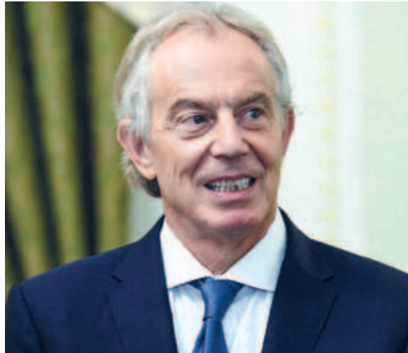
Former UK Prime Minister Tony Blair denounced ending “the forever wars” by the U.S. as “imbecilic.”