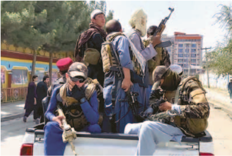
Taliban fighters on patrol in Kabul, Afghanistan, August 17, 2021.

of them were hungry, so the motivation was absolutely not there.