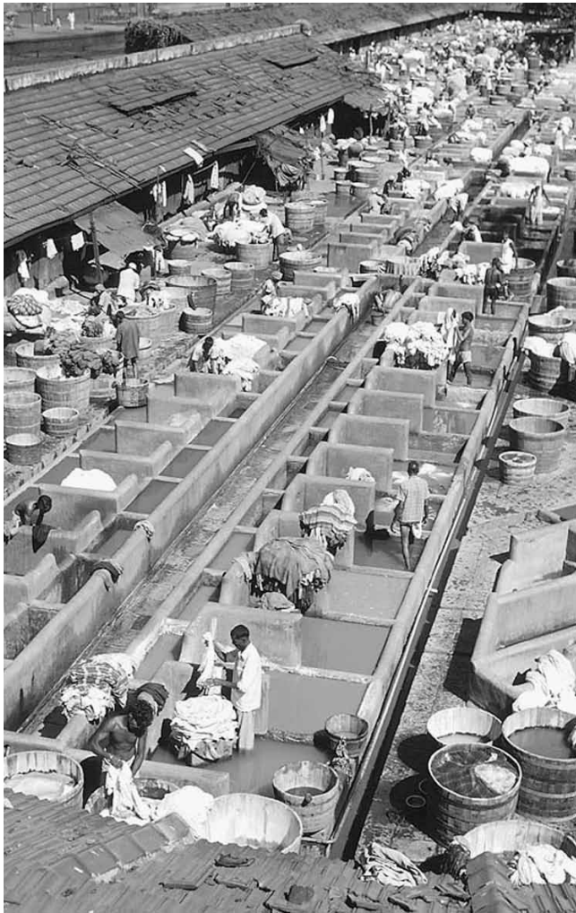
An extreme water deficit is keeping India's population in misery. Here, slum-dwellers wash their clothes at a public laundry in Bombay in the 1930s.

gen-based fuels are the most efficient chemical fuels in existences. We can use them, produce them regionally and locally. We do not have to import oil; we do not have to use inferior methods of production.