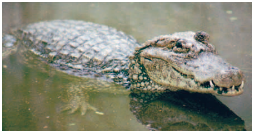
If this caiman doesn't eat you, the financial speculators on the Cayman Islands will.

Now what we're going to have to do, is the following: This means we are going to have to replace the current President of the United States. We're going to have send the Vice President to places where he belongs. Mr. [I. Lewis "Scooter"] Libby may have suggestions on that point. To have a President, because our system does not function without a President, and we don't have a functional President on the premises. We have a dummy—worse than a dummy, a