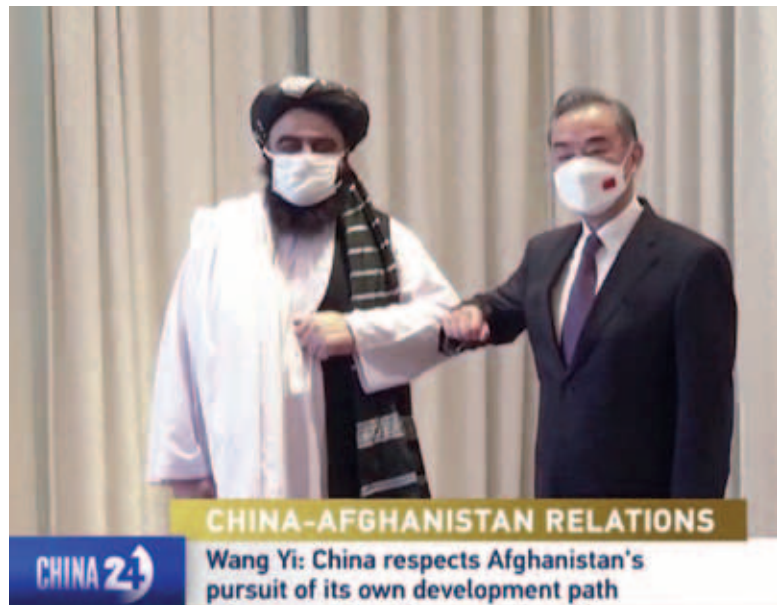
Wang Yi, China's State Councilor and Foreign Minister, meeting in Doha, Qatar with Amir Khan Muttaqi, Acting Foreign Minister of the Taliban's Interim Government of Afghanistan. October 26, 2021.

The Chinese Foreign Minister Wang Yi just met in Doha with the Taliban, with interim Acting Deputy Prime Minister Abdul Ghani Baradar and acting Foreign Minister Amir Khan Muttaqi, and Wang Yi ap-