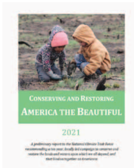
Mandated by Section 216 of EO 14008, this report serves as a roadmap for achieving the 30x30 goal.

And what are these tools? Money, of course. With thousands of farmers and ranchers on the verge of bankruptcy due to decades of globalized free trade, food cartelization, and Wall Street commodities speculation, the Biden administration is banking on cash incentive schemes to grab up millions of acres of prime farmland in order to meet the 30x30 quota. Various programs are mentioned in the report, such as the Working Lands for Wildlife initiative and Conservation Reserve Program, all geared towards enticing financially desperate farm-