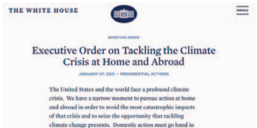
White House President Joe Biden’s Executive Order 14008 mandates achieving the removal of 30% of U.S. land and water from human activity by 2030 (“30x30”).

President Biden, after announcing on his inauguration day that the U.S. was back in the COP21 Paris Climate Agreement, issued seven days later, on January 27, 2021, Executive Order 14008, containing the 30x30