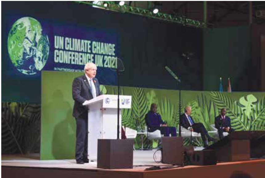
UK Government/Karwai Tang