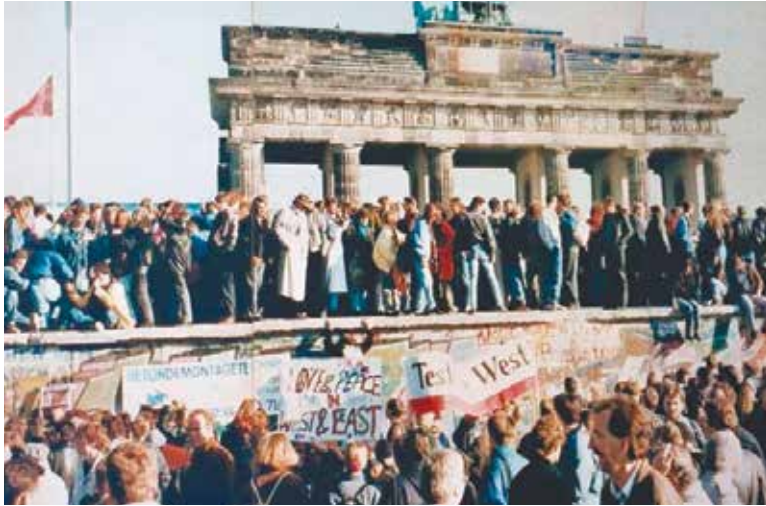
With the fall of the Berlin Wall in 1989 and the subsequent dissolution of the Iron Curtain, there was an historic chance for a great change. That opportunity was squandered.

of Europe with those of Asia through infrastructure development corridors. Such a policy would have created the basis for a peace order for the 21st Century. While there was great support for this visionary policy among many industrialists and peace-loving forces in many countries, the Neo-cons in the U.S. and their British partners had no intention of allowing it.