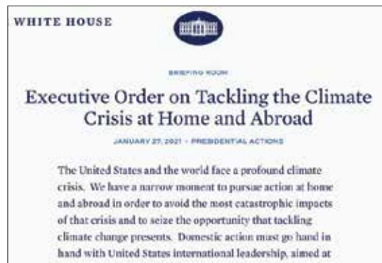
White House Executive Order 14008 mandates that 30% of U.S. land and water must not be available for human economic use.

Carbon “credit” trading, underway for years in the EU with the ETS (Emissions