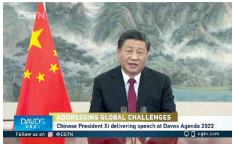
President Xi Jinping addresses the World Economic Forum's Agenda 2022 conference.