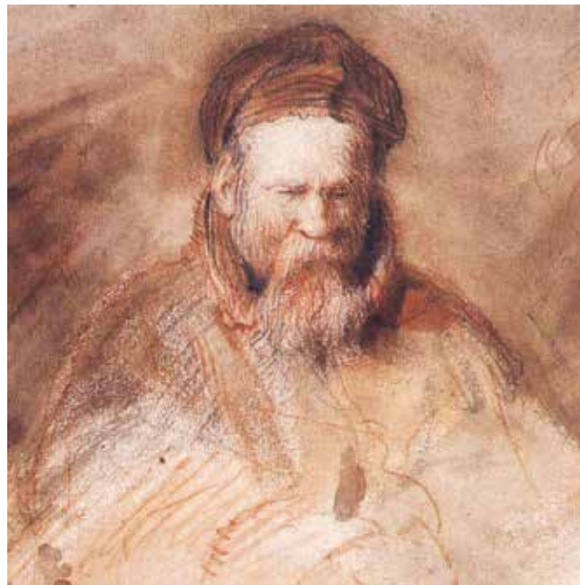
Philo of Alexandria (c. 20 BCE–c. 50 CE) attempted to cleanse Judaism of cabalistic and other Babylonian cultisms.

The influence of Christianity on the course of secular society is better appreciated by study of the efforts of Philo of Alexandria to cleanse Judaism of cabalistic and other Babylonian cultisms embodied in his time in the rule over the Jews by the evil Sadducees and Pharisees. Philo’s collaboration, at Rome, with Saint Peter, against the archetypical, pseudo-Christian gnostic, Simon Magus “The Magician,” underscores the con-