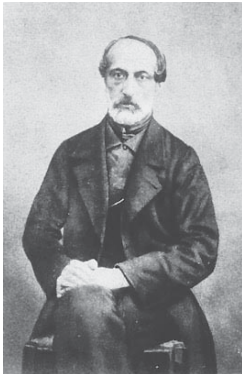
Giuseppe Mazzini (1805–1872), under Lord Palmerston’s guiding hand, created and ran the revolutions of 1848 throughout Europe, including the Communist League.

Like Ruskin’s Pre-Raphaelite Brotherhood, the network of Venice-centered “families” was committed before and during Ruskin’s lifetime to destroying the institution of the modern nation-state republic throughout the world, and to eliminating the commitment to technological progress associated with modern sovereign republics. In brief, the Venetians and their accomplices have never accepted the existence of that modern industrial-capitalist sovereign nation set into motion with Louis XI’s creation of modern France during the late 15th century. They are the wealthiest collection of