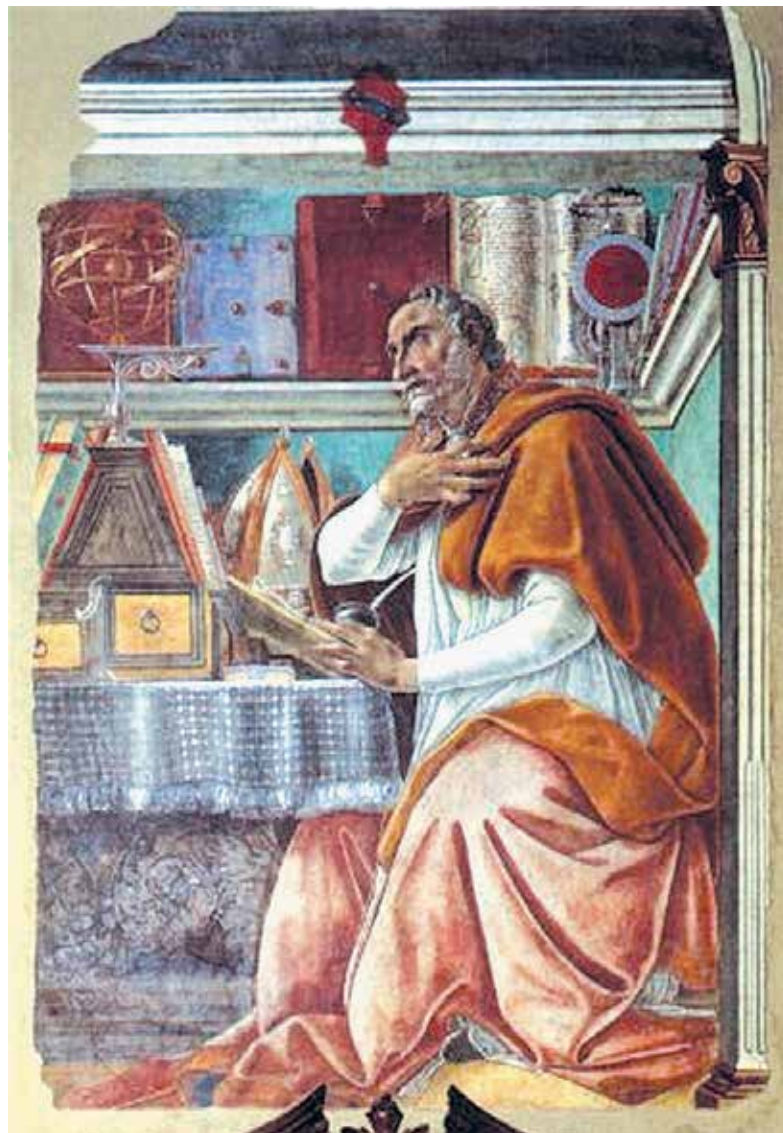
St. Augustine of Hippo (354–430) defended the Apostolic Christian doctrine and the Nicene faith. On the practical side of the doctrinal issue, he demonstrated that not only the Roman Empire, but the City of Rome before it, represented a morally degenerate society. Here: Saint Augustine in His Study, by Sandro Botticelli in 1480.

The affinity of the Eastern Platonic Fathers to the subsequent doctrine of St. Augustine is to be found in the decrees and resolutions of the first two Ecumenical Councils, of Nicaea and Constantinople, which produced two basic tenets of Christianity, the Nicaean Credo , a liturgical affirmation of faith in the Triune God; and the broader body of doctrine, known as the Nicene faith, which, independently of liturgical forms, affirms the incarnated Christ to be consubstantial, or homoousios , with God the Father. The Eastern Platonic Fathers, always a minority, had to struggle at all times against the authority of the Emperor and simultaneously against the numerically overwhelming Egyptian and related cults whose main effort centered in challenging under various guises, the homoousios , or consubstantial nature of the Christ; some cult-heresies asserted Christ to be only divine and not human, others only human and not divine, some both divine and human but whose divine nature is dis-