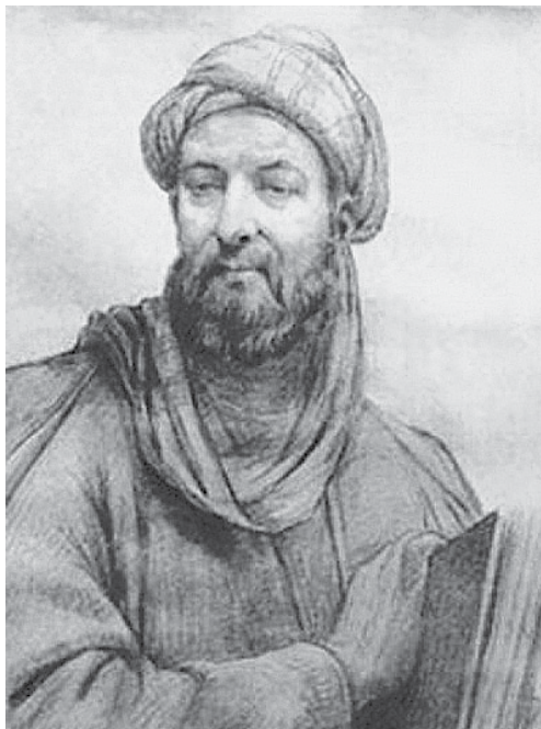
Ibn Sina, the great polymath and physician (980–1037). Like Philo's Judaism, his Islam was Platonic (or, neo-Platonic).

For all of these, from Bacon through the degenerate Milton Friedman, there exists no efficient higher order in the universe, but only the monetary gratification of the hedonistic impulses of a degraded man-beast, a beast defined to be in a "war of each against all." The