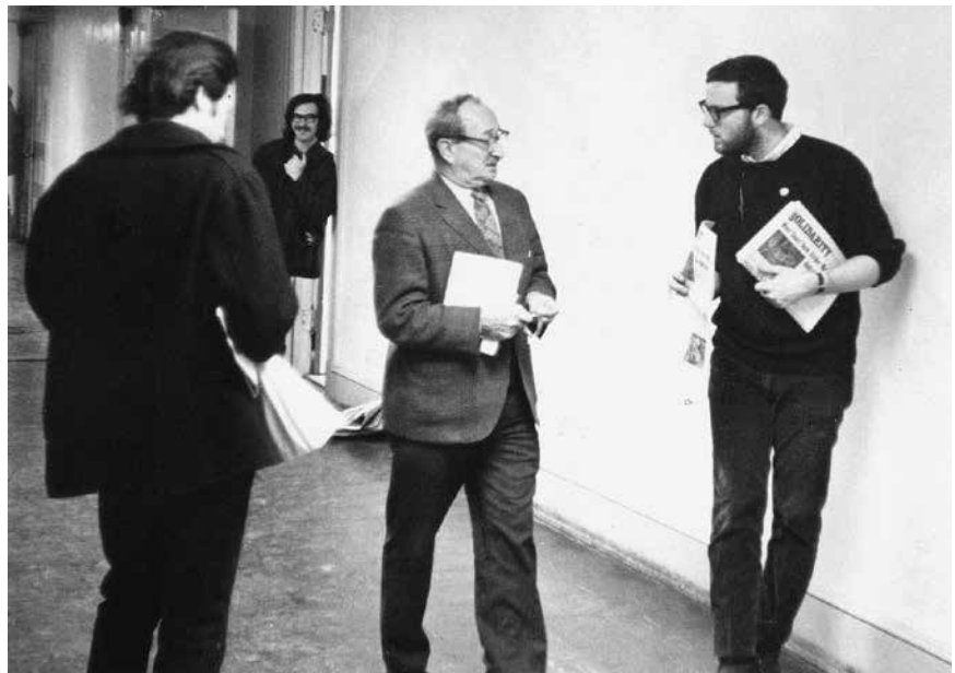
Two LaRouche organizers confront Sidney Hook of the Hoover Institution, New York City, 1972.

Let us not overlook the obvious. If there is a "Propa-