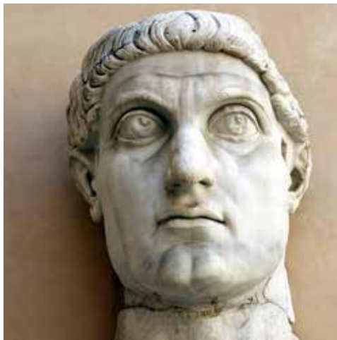
The cult-controlled pseudo-Christian, Emperor Constantine I (reigned 306–337).

Justinian's Code did not settle the issue in the East. At the beginning of the present millennium, and, later, with the rise of the Paleologues, the forces mobilized around the policy of teaching classical Greek temporarily seized power. However, throughout the period from Justinian, beyond the Greek church's leading role in bringing Ottoman rule over Greece in 1453 A.D., pre-