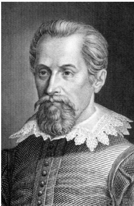
By successive inscribing and circumscribing of the series of Platonic solids with respect to spheres, Johannes Kepler (1571-1630) determined the necessary ordering of the solar orbits.

Development in musical composition is affected either through explicit polyphony, or the projection of a