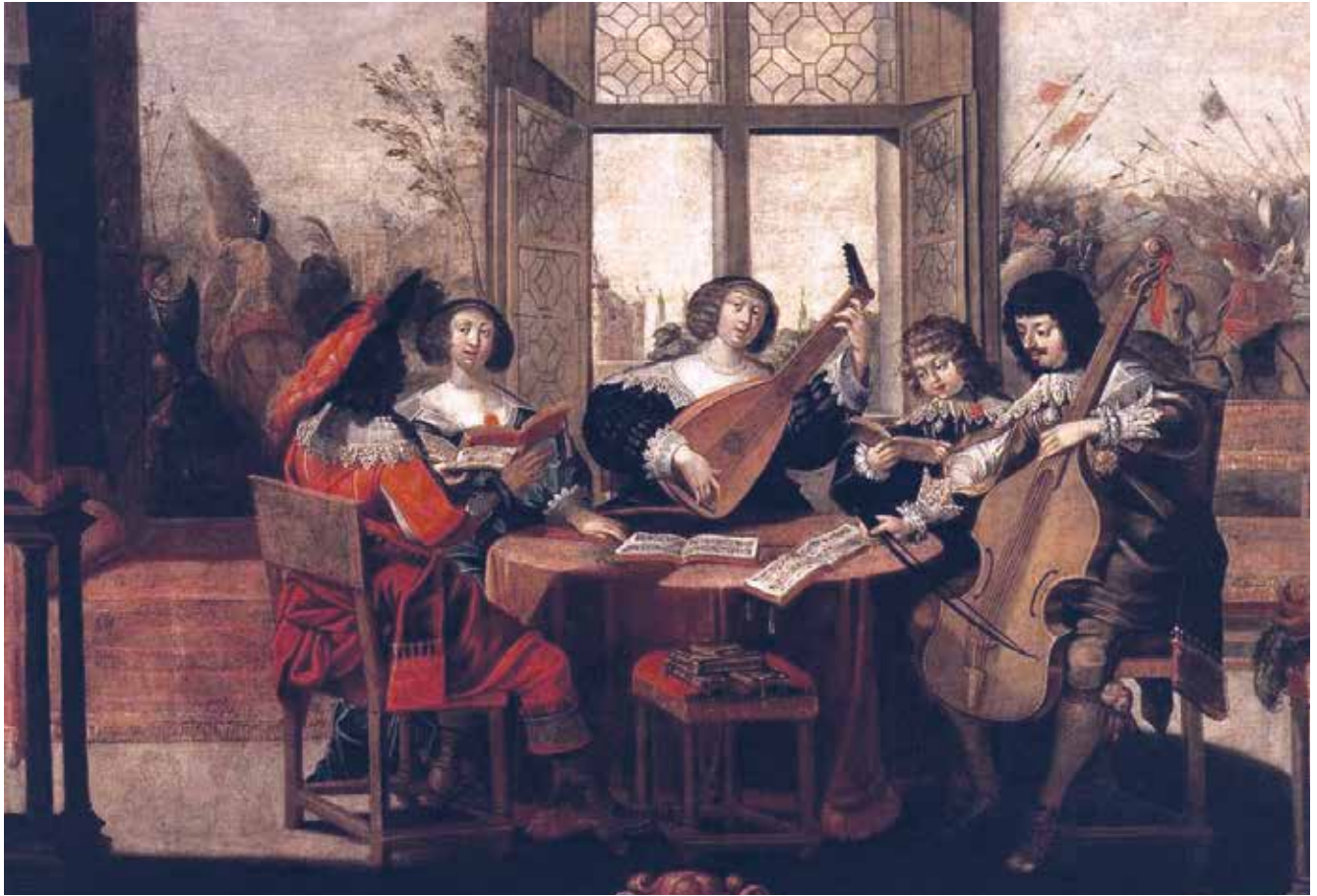
The lawful ordering of the universe is found in the transformations of verbal action in literate languages, well-tempering in classical music, and in the topology of constructive geometry. Here, a painting titled Hearing by an unknown artist based on an engraving by Abraham Bosse from c. 1635.

During a mere several years, circles under the direction of Lazare Carnot developed the expanded industrial basis needed to support what was, for that time, unprecedented rates of mass production of improved, lighter, more mobile field artillery. Around the change in battlefields implicit in a mobile base of massed artillery-fire, Carnot et al. effected a correlated transformation in the development and coordinated deployment of arms of battle