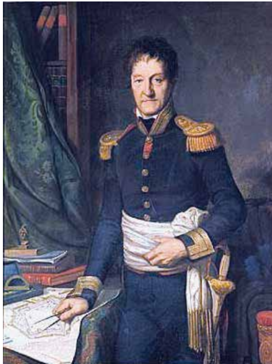
Louis François Lejeune, 1842

Editor's Note: This article first appeared in EIR Vol. 8, No. 32, Aug. 18, 1981, pp. 37-42.